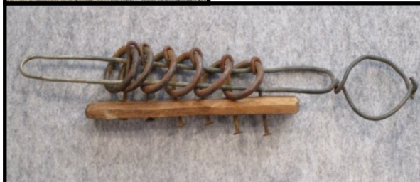
These wooden toys were played with by the Thurmond children on their North Fork ranch west of Buffalo Bill Reservoir.

creation of Park County. In 1910, Charles paid $10 for his guiding license, which is equivalent to roughly $300 today. This summer's displays also include Charles' folding candle lantern from 1906 with its original leather case. Popular among campers and hunting guides of the time, the lantern featured a wind shield and peaked steel top designed to protect the candle flame. Additional artifacts on display highlight the daily activities of the Thurmond