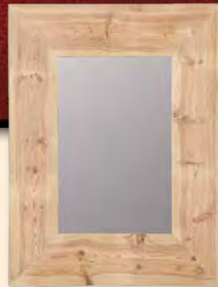
#12 M – Wide Plank Frame Mirror 72”H x 48”W