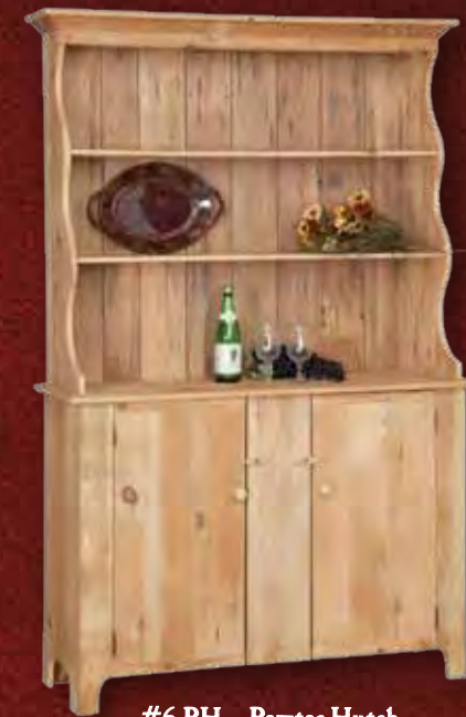
#6 PH – Pewter Hutch 80"H x 52"W x 17-1/2"D