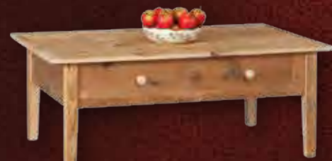
#8 SCT – Shaker Coffee Table 19"H x 48" W x 30"D