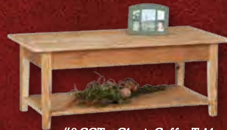
#8 CCT – Classic Coffee Table 20"H x 48" W x 24"D