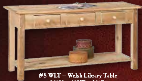
#8 WLT – Welsh Library Table 30"H x 60" W x 20"D