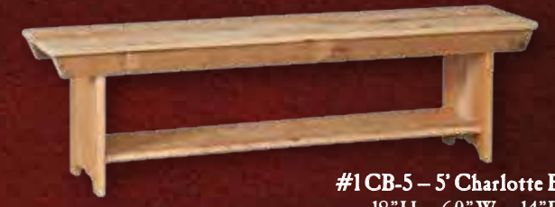
#1 CB-5 – 5' Charlotte Bench 18"H x 60" W x 14"D