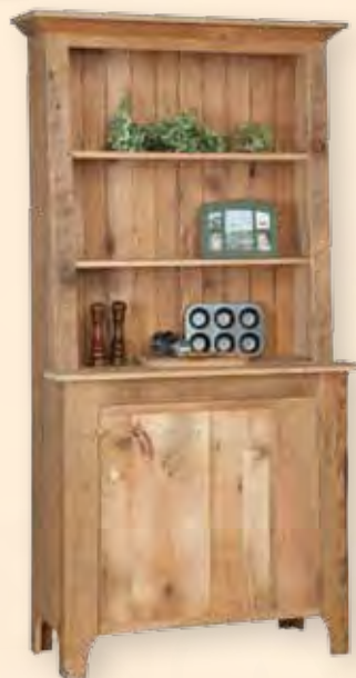
#6 SBH – Slant Back Hutch 79"H x 42"W x 17"D