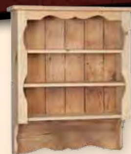
#11 HDS – Hanging Display Shelf 32”H x 27”W x 8”