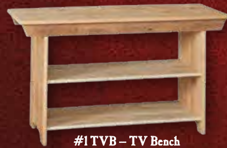
#1 TVB – TV Bench 27"H x 48" W x 18"D