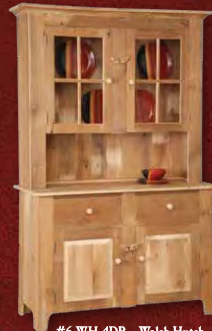
#6 WH-4DP – Welsh Hutch 80"H x 52"W x 20-1/2"D