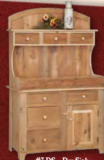
#7 DS – Dry Sink 66”H x 42-1/2”W x 20-1/2”D