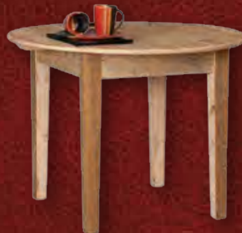
#9 RT – Standard Top Round Table 30"H x 40" Diameter