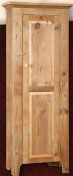
#5 CC – 6' Chimney Cupboard with Raised Panel Door 72"H x 28"W x 14"D