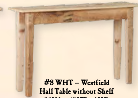
#8 WHT – Westfield Hall Table without Shelf 30"H x 48" W x 12"D