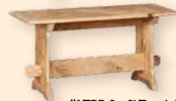
#1 TRB-3 – 3' Trestle Bench 18"H x 36" W x 14"D