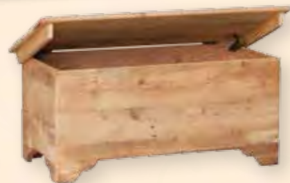
#12 BC – Blanket Chest 18"H x 40"W x 18"D