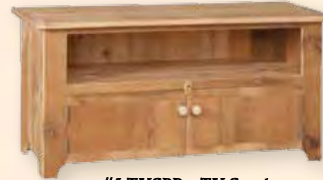
#5 TVSBB – TV Stand with Bread Board Doors 24"H x 49"W x 20"D