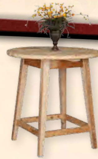
#9 PT – Pub Table 36” or 42”H x 40”Diameter