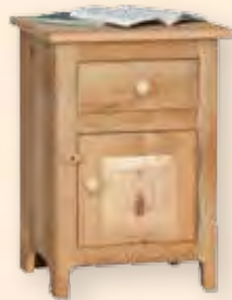
#2 NSR – Night Stand with Raised Panel Door and Drawer 26”H x 18”W x 16”D