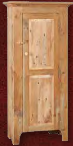
#5 CC – 5' Chimney Cupboard with Raised Panel Door 60"H x 28"W x 14"D