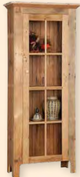
#5 PGFC – 8 Pane Glass Cabinet without Drawer 80"H x 34"W x 14"D