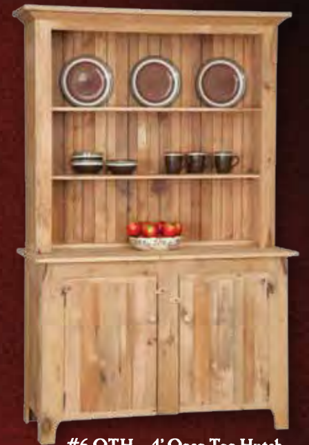
#6 OTH – 4' Open Top Hutch 80"H x 52"W x 17-1/2"D