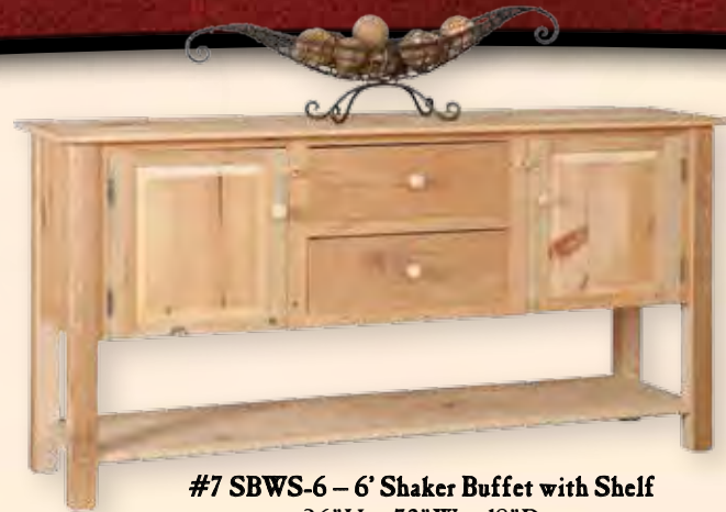
#7 SBWS-6 – 6' Shaker Buffet with Shelf 36"H x 72"W x 18"D