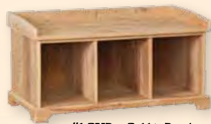
#1 CUB – Cubbie Bench Available with 2 or 3 Compartments 20"H x 40"W x 19"D