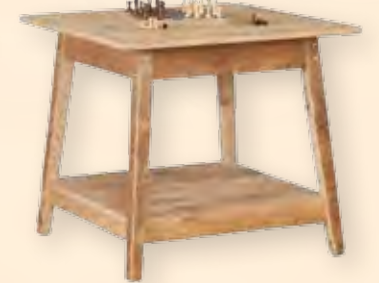
#8 CT-S30 – 30” Square Cricket Table 27”H x 30”Square