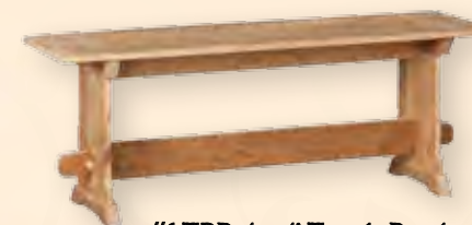
#1 TRB-4 – 4' Trestle Bench 18"H x 48" W x 14"D