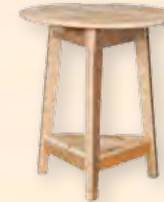
#8 CT-R24 – 24” Round Cricket Table 27”H x 24”Diameter

Both Cricket Tables Available in 24” and 30”