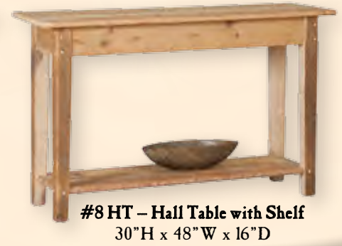
#8 HT – Hall Table with Shelf 30"H x 48" W x 16"D