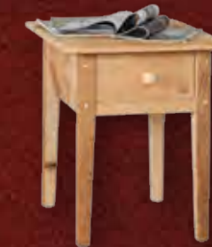
#8 Set – Shaker End Table without Shelf 24”H x 20”W x 24”D