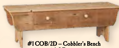
#1 COB/2D – Cobbler's Bench with 2 Drawers 18"H x 54" W x 16"D