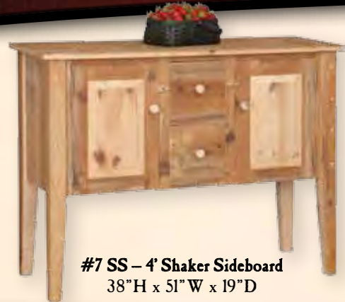
#7 SS – 4' Shaker Sideboard 38"H x 51"W x 19"D