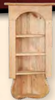
#11 HCS – Hanging Corner Shelf 37”H x 14” from Corner