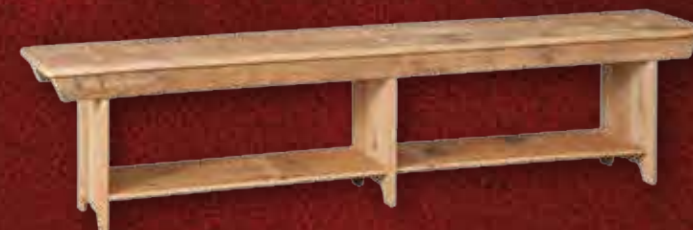
#1 CB-6 – 6' Charlotte Bench 18"H x 72" W x 14"D