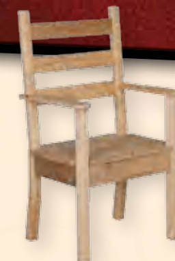
#4 RCA – Rustic Reclaimed Oak Chair with Arms 42”H x 25”W x 18”D