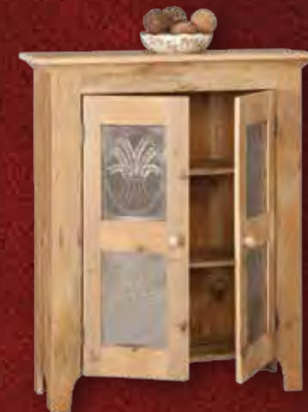
#5 PSD-2 – Pie Safe-Double Door 48"H x 40"W x 14"D