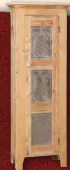
#5 PSD-1 – Pie Safe 66"H x 25"W x 14"D