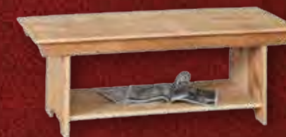
#1 CB-4 – 4' Charlotte Bench 18"H x 48" W x 20"D