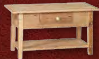
#8 MSCT – Mini Shaker Coffee Table 19"H x 36" W x 18"D