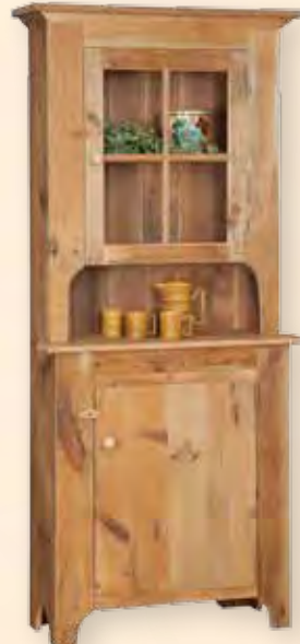
#6 SDSH – Single Door Shaker Hutch 76"H x 34"W x 14"D