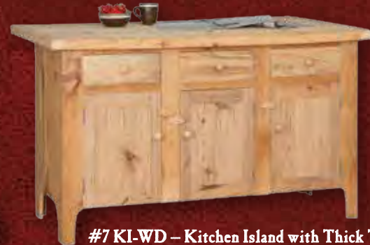
#7 KI-WD – Kitchen Island with Thick Top 36”H x 60”W x 36”D