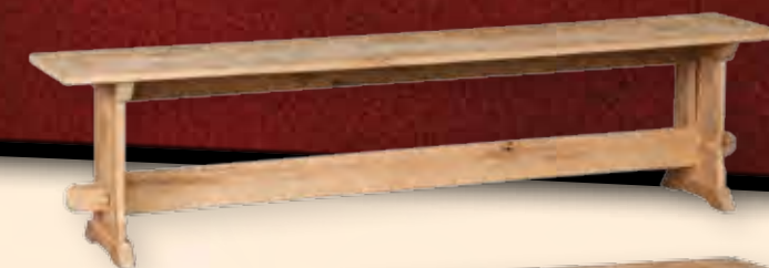
#1 TRB-6 – 6' Trestle Bench 18"H x 72" W x 14"D