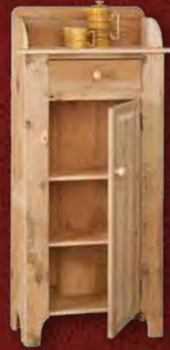
#5 MC – Milk Cupboard 56"H x 27"W x 13-1/2"D