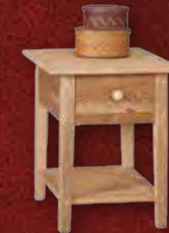
#8 Set – Shaker End Table with Shelf 24”H x 20”W x 24”D