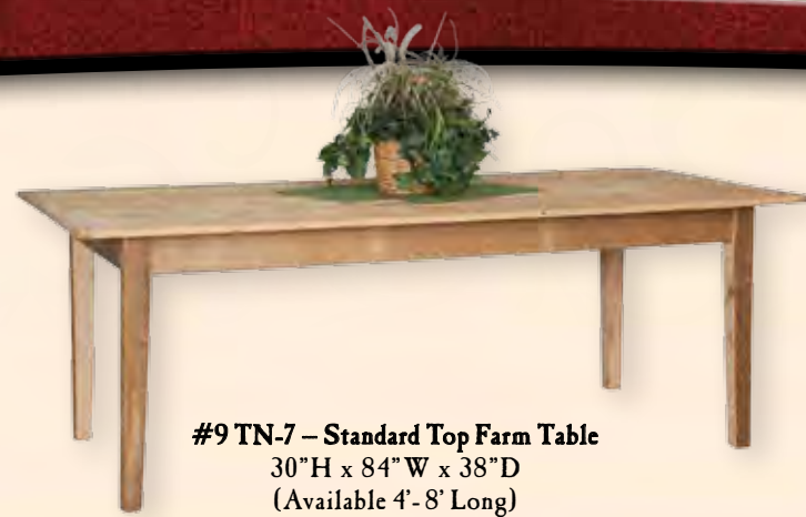
#9 TN-7 – Standard Top Farm Table 30"H x 84" W x 38"D (Available 4'-8' Long)