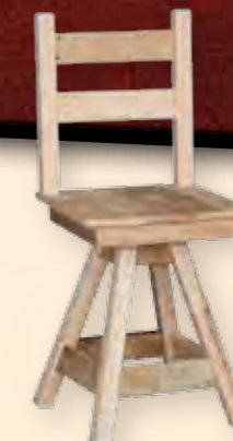
#4 PC – Pub Chair 25”W x 18”D Available in 24” & 30” Seat Height