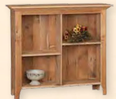
#3 BCOS – Offset Bookcase 40"H x 44"W x 14"D