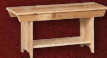
#1 CB-3 – 3' Charlotte Bench 18"H x 36" W x 14"D