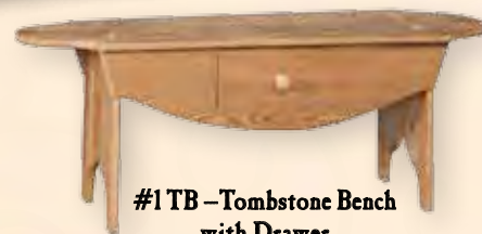
#1 TB – Tombstone Bench with Drawer 18"H x 48" W x 16"D