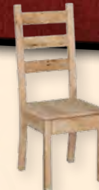
#4 RC – Rustic Reclaimed Oak Chair without Arms 42”H x 17”W x 18”D