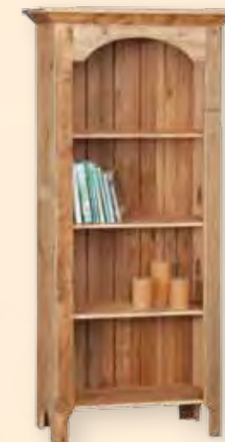
#3 BC25 – 2x5 Lyndell Bookcase 60"H x 28"W x 14"D