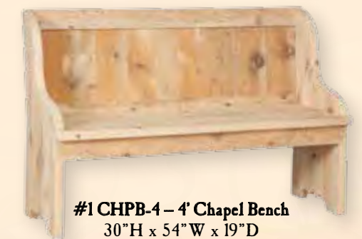
#1 CHPB-4 – 4' Chapel Bench 30"H x 54"W x 19"D