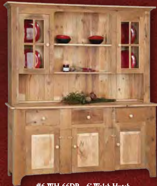
#6 WH-66DP – 6' Welsh Hutch 80"H x 70"W x 20-1/2"D