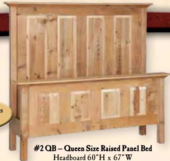
#2 QB – Queen Size Raised Panel Bed Headboard 60”H x 67”W Footboard 30”H x 67”W