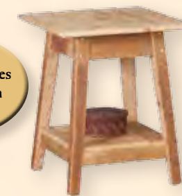
#8 CT-S24 – 24” Square Cricket Table 27”H x 24”Square

Both Cricket Tables Available in 24” and 30”