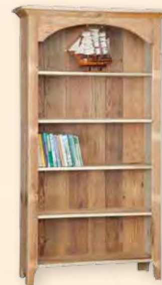
#3 BC36 – 3x6 Lyndell Bookcase 72"H x 40"W x 14"D