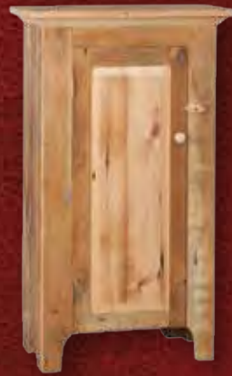
#5 CC – 4' Chimney Cupboard with Raised Panel Door 48"H x 28"W x 14"D