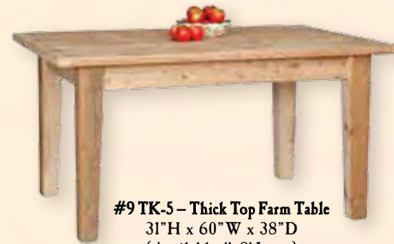
#9 TK-5 – Thick Top Farm Table 31"H x 60" W x 38"D (Available 4'-8' Long)