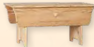
#1 COB/WD – Cobbler's Bench with Drawer 18"H x 36" W x 16"D