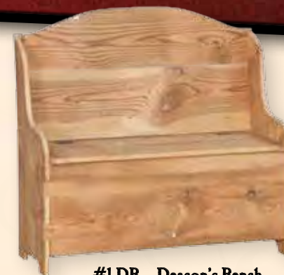
#1 DB – Deacon's Bench 39"H x 40"W x 18"D