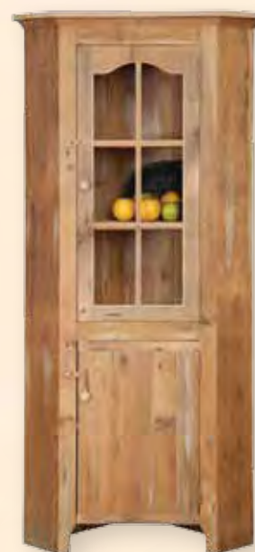
#5 LCCG – Lancaster Corner Cupboard with Glass Door 80"H x 27" from Corner (Also Available with Open Top)