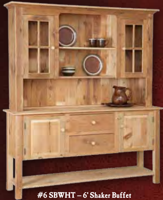
#6 SBWHT – 6' Shaker Buffet with 66" Welsh Hutch Top 82"H x 72"W x 18"D