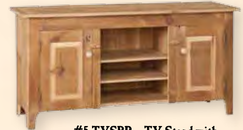
#5 TVSRP – TV Stand with Raised Panel Doors & 2 Adjustable Shelves 24"H x 60"W x 20"D