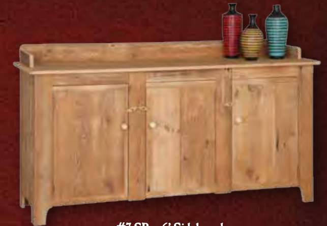
#7 SB – 6' Sideboard with Bread Board Doors 40"H x 72"W x 20-1/2"D