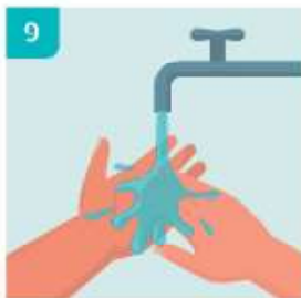
9 RINSE HANDS