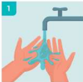
1 WET HANDS

PROTECT YOURSELF AND OTHERS AGAINST INFECTIONS