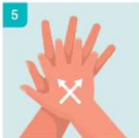
5 SCRUB BETWEEN YOUR FINGERS