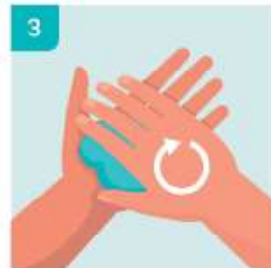
3 RUB HANDS PALM TO PALM