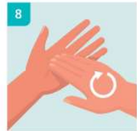
8 WASH FINGERNAILS AND FINGERTIPS