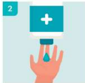
2 APPLY SOAP