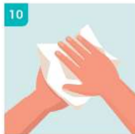
10 DRY WITH A SINGLE USE TOWEL