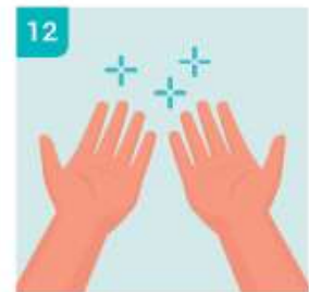
12 YOUR HANDS ARE CLEAN