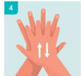
4 LATHER THE BACKS OF YOUR HANDS