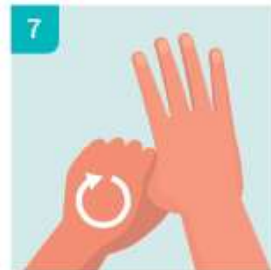
7 CLEAN THUMBS