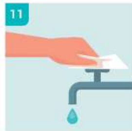
11 USE THE TOWEL TO TURN OFF THE FAUCET