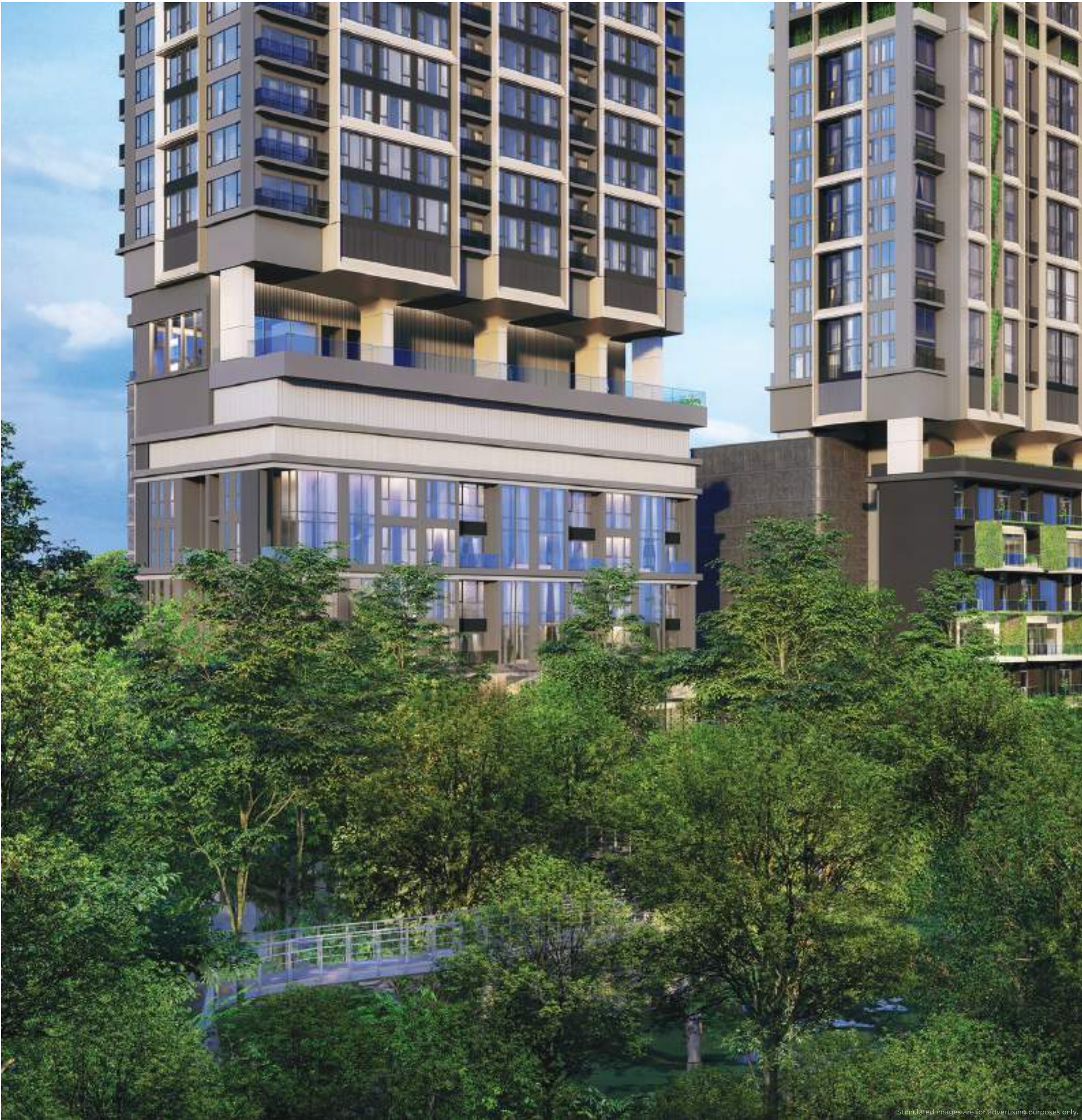
Stimulated images are for advertising purposes only.