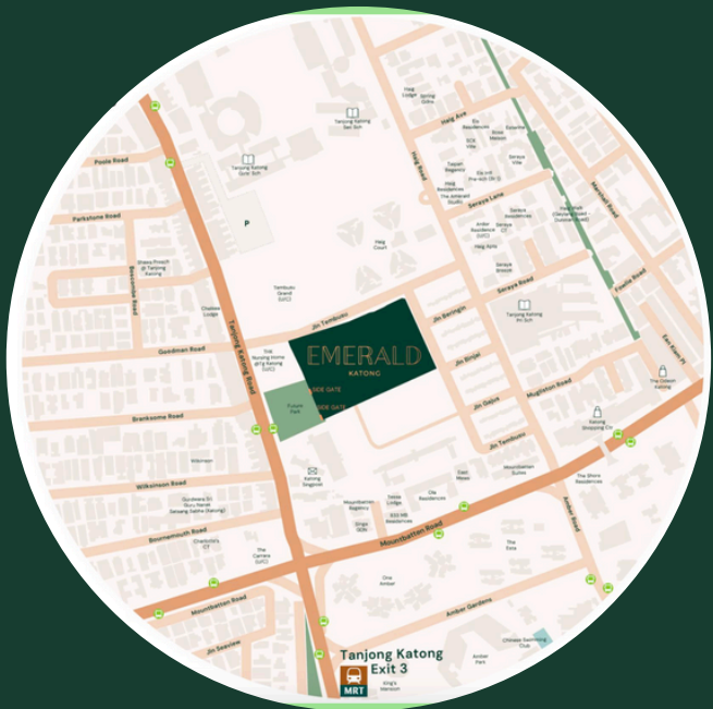
500M RADIUS OF EMERALD OF KATONG

This prime location provides a perfect blend of convenience, culture, and lifestyle, making Emerald of Katong 嘉乐轩 an ideal home.