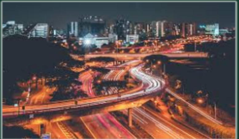
2 MIN DRIVE TO ECP

Whether commuting for work or leisure, residents will appreciate the ease with which they can navigate the island, making Emerald of Katong 嘉乐轩 an ideal home for those seeking both luxury and accessibility in one of Singapore's most vibrant neighborhoods.