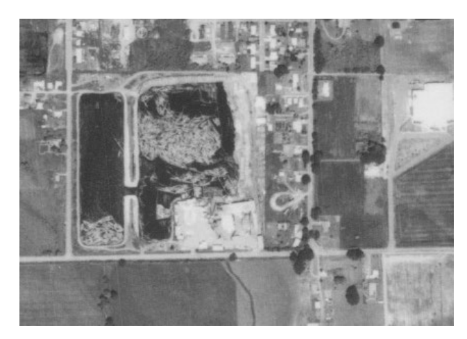
Aerial view of Philomath Mill in 1978.

MPC Builders is building homes on the former Philomath Mill site. The subdivision is on the northeast corner of S. 15th St. and Chapel Drive. The developer has built about 60 homes so far and has plans for 212 in total. The existing homes have been equipped with mitigation features, such as vents and fans, to help prevent accumulation of biogases, and methane alarms to alert residents if methane accumulates under homes. In July 2021, MPC Builders signed an agreement with DEQ that requires MPC to complete a thorough and timely investigation to determine what measures, if any, may be needed to address biogases in soil at the development.