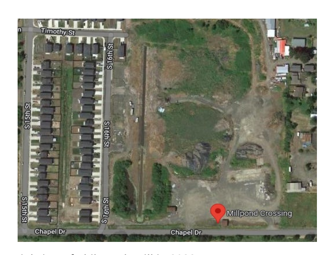
Aerial view of Philomath Mill in 2022.