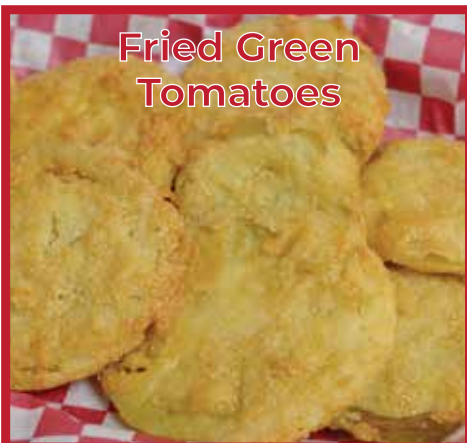
Fried Green Tomatoes