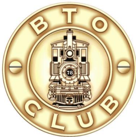
The B. Tee O.