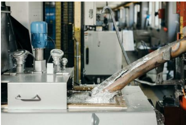
Liquid zinc alloy is filled into a tank before being cast with an industrial metal press.

BERLIN - Last spring, the managers at Märklin, the 162-year-old maker of model trains, were surprised by the unexpected upsurge in sales reports. Märklin's monthly orders were up 70 percent over the previous year in November. Along with baking and jigsaw puzzles earlier during the pandemic, model trains are among the hobbies being rediscovered while people are cooped up indoors. Märklin makes LGB trains, which are larger outdoor models.