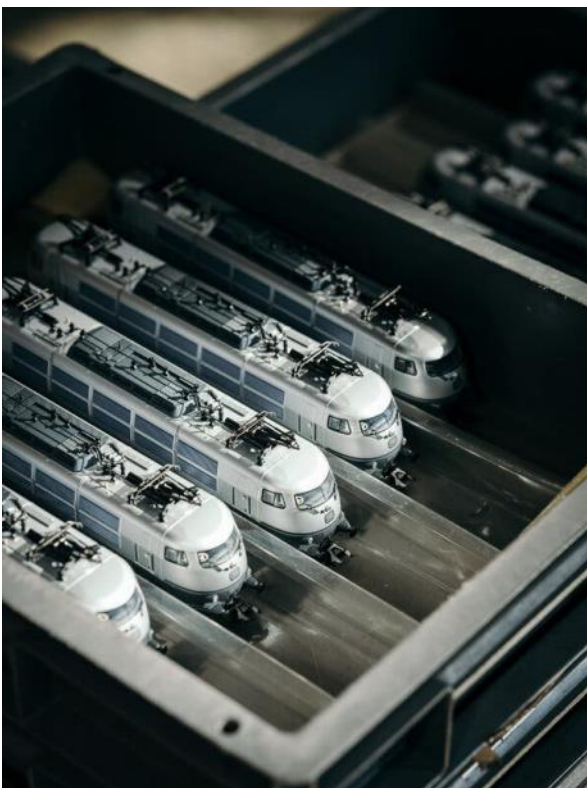
Modern model trains can reproduce dozens of digital noises.