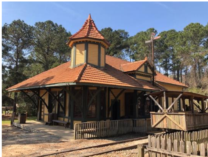
Below: Train at Agra-Rama.