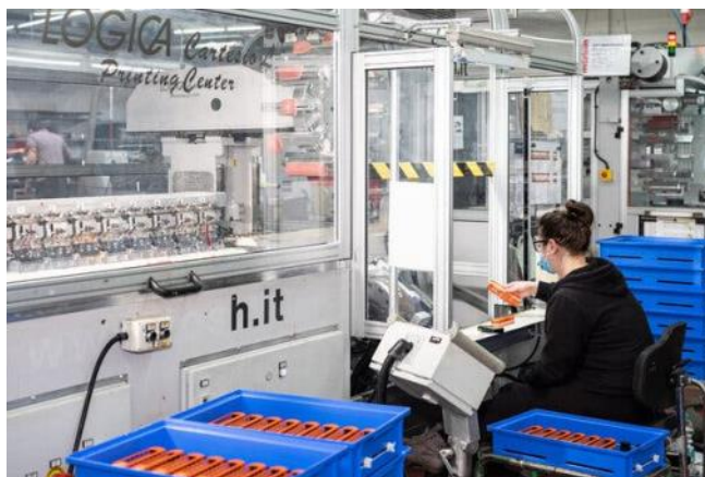
A stamp printing machine that applies detailed small prints to the casings.