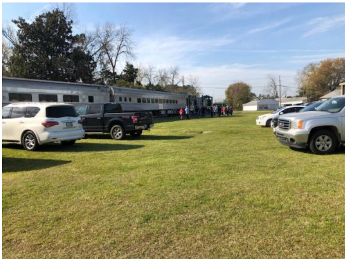
Left: Parking for train at Nashville.