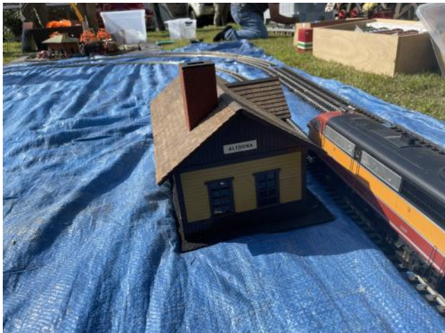
Altoona Depot at the Chatsworth expo got a lot of traffic the day we were there. - Editor

Theme for the Month - Depots: Last month had no member layout. We were working at the Chatsworth Depot, so ..... Show us your Depots!