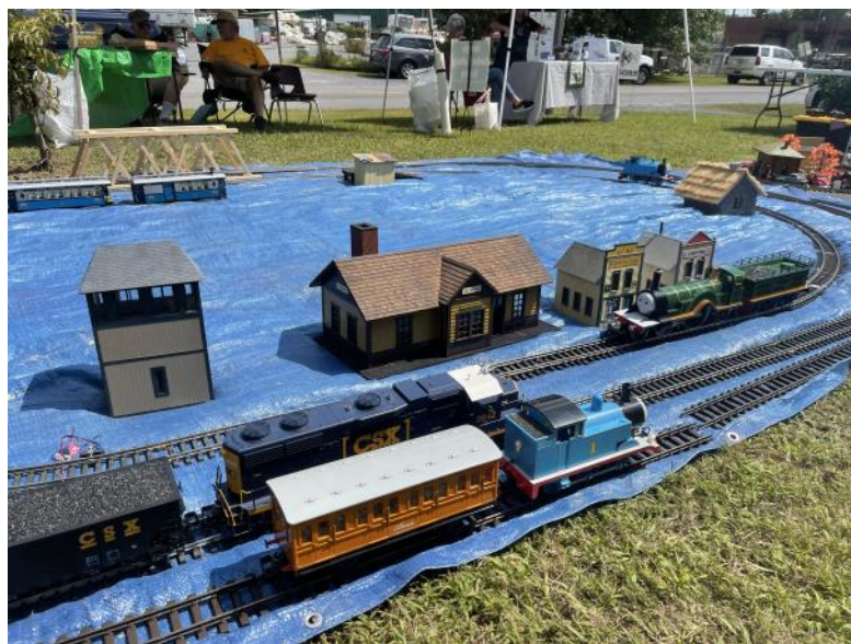
Not sure if Pam's Egg Liner village had a name, but the multiple units that ran past the depot and the activity around it certainly indicated a lively train based population in the town. - Editor