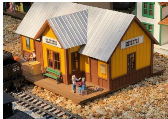
The Durango and Silverton Depots.