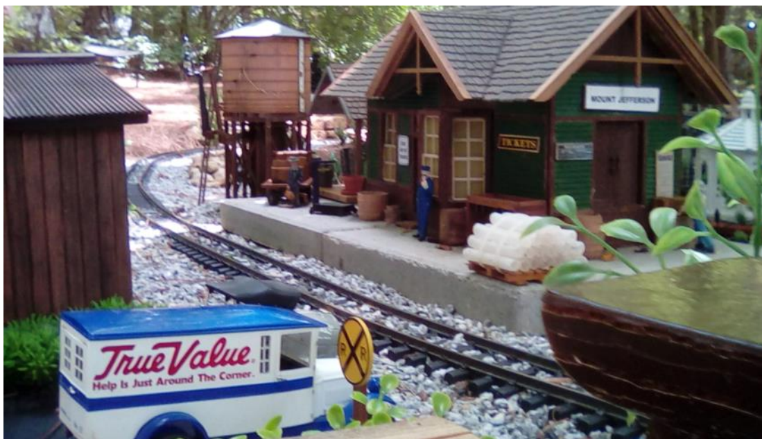
The Mount Jefferson Depot.