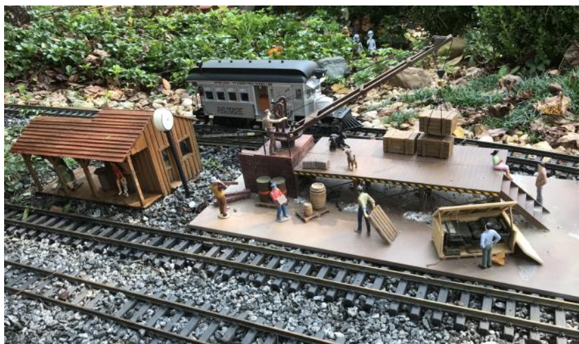
The Depot at Cedar Creek seems no less busy, moving freight