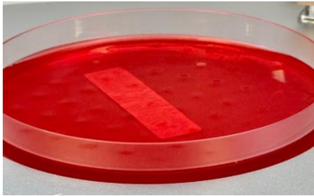
Figure 1, Blood Agar with 60 pins inoculum, Don Whitley Scientific Limited

The efficient design of the HMI-60&24 inoculator head accommodates 60 pins, allowing this number of bacterial strains to be accurately deposited onto a standard 90 mm agar plate. Although this necessitates inoculum sites that are tightly spaced, a special treatment applied by the manufacturer to the steel pins eliminates dripping of the inocula and produces well defined inoculum sites on various agar formulations. In our work we use supplemented