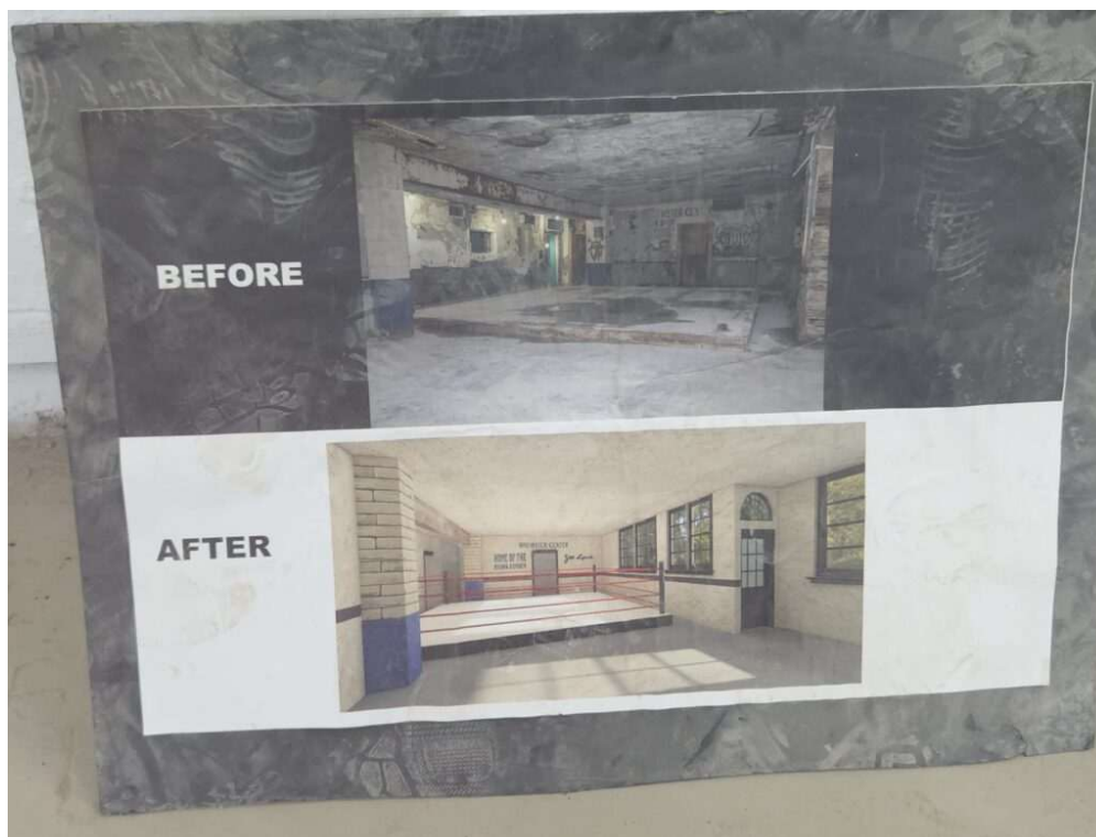
The before and after images of Joe Louis' ring