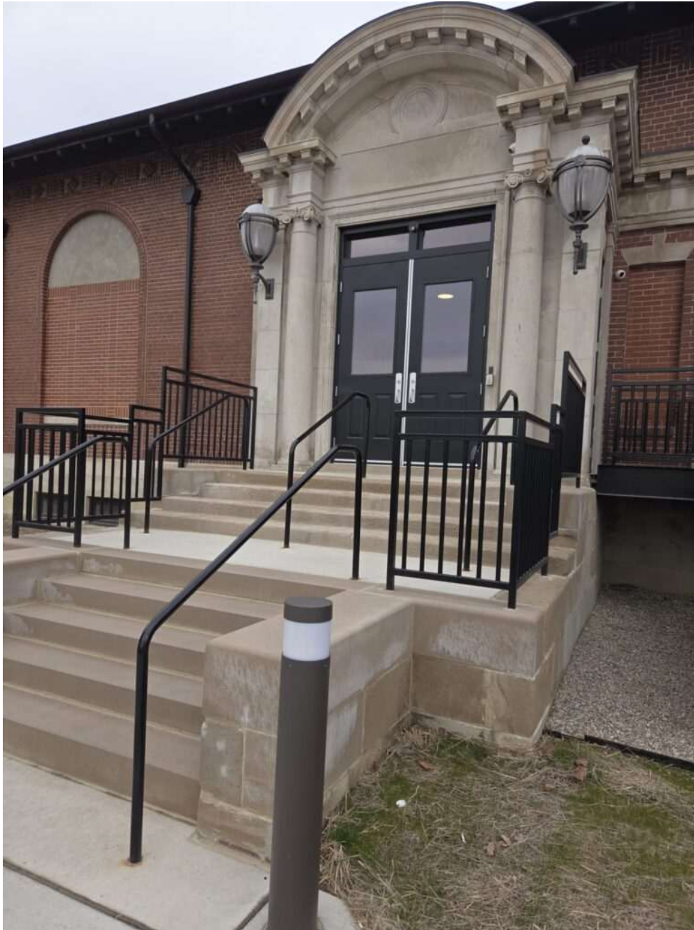
The entrance to KRONK Gym at the Brewster-Wheeler Recreation Center

Through the decades, KRONK Gym has become a cornerstone of Detroit's boxing legacy, serving not just as a training ground for aspiring fighters, but as a symbol of the city's resilience, grit, and passion for the sport. The gym's influence extends far beyond its walls, having produced world-class champions and legendary trainers, most notably Emanuel Steward , whose leadership transformed KRONK into an international powerhouse. Boxing legends hail from KRONK, which Emanuel Steward owned and operated since 1971.