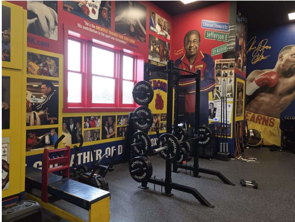
Dedicated area known as Emanuel's Corner