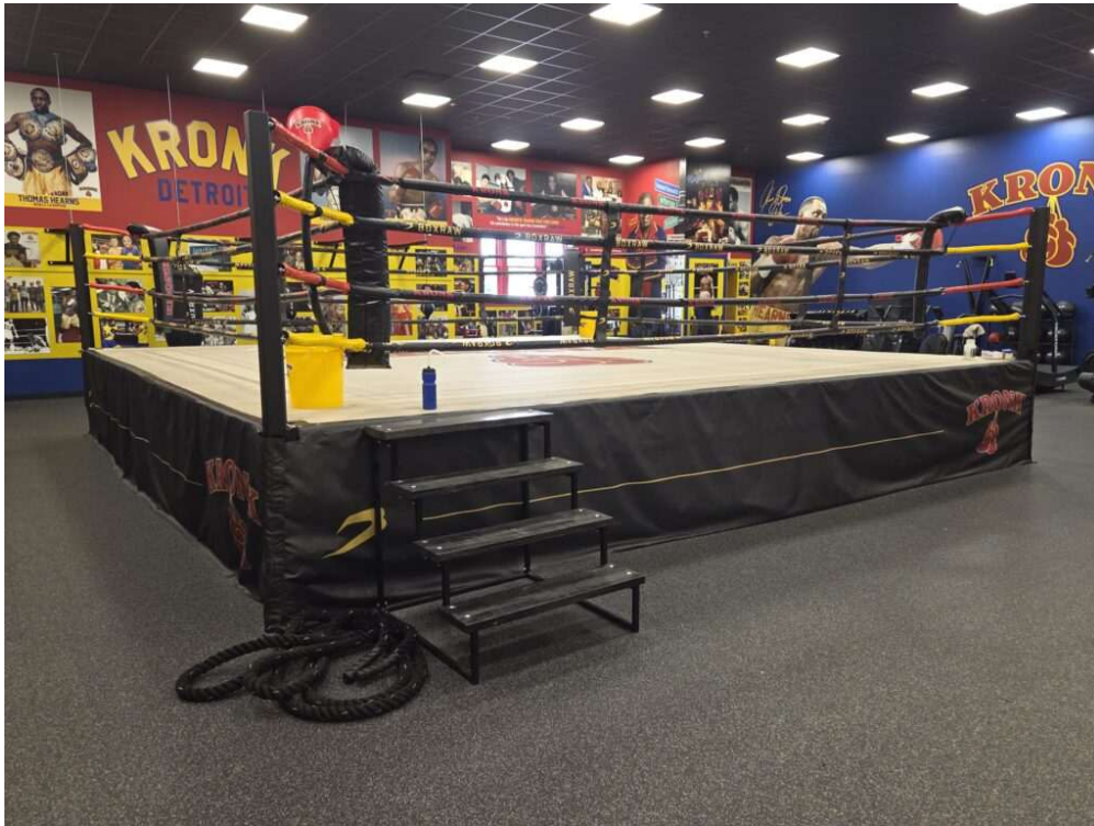
The infamous ring at the KRONK