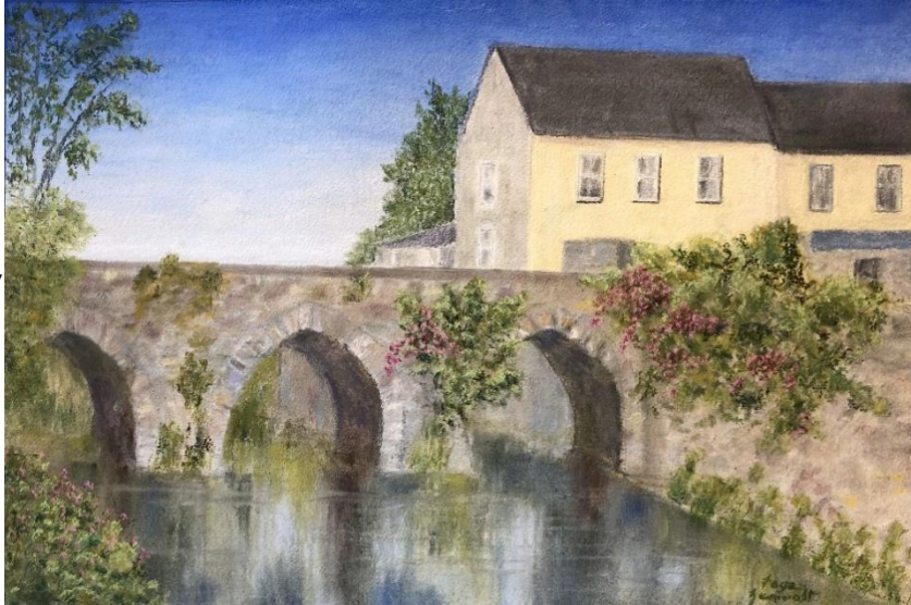
“Oldest Bridge in Ireland – County Meath”

“Every child is an artist. The problem is how to remain an artist once we grow up.” – Pablo Picasso