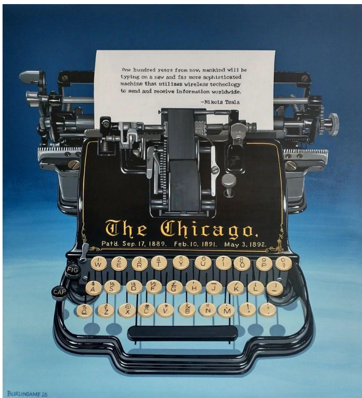
“Thinking Outside the Box”