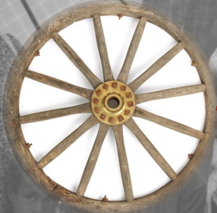
What the Regulations / Guidelines require