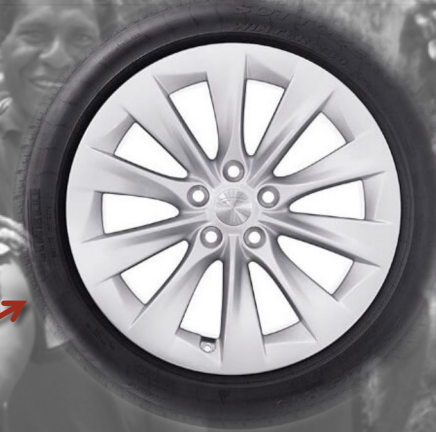
The Product – Tailored to the needs of the Project