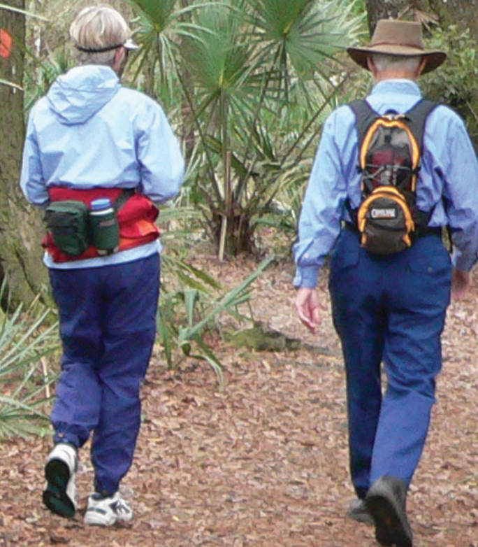
Crossing Central Florida from the Gulf of Mexico to the St. Johns River