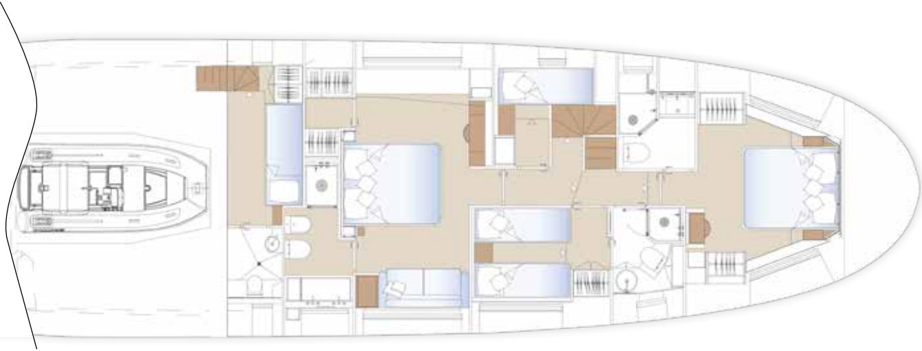
LOWER DECK Version B (optional)