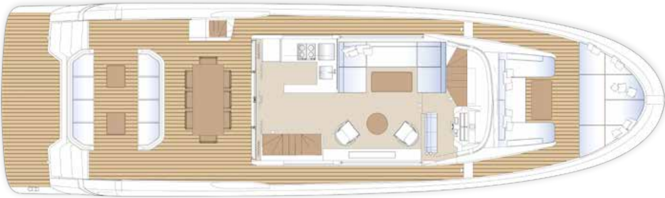
MAIN DECK Version B (optional)