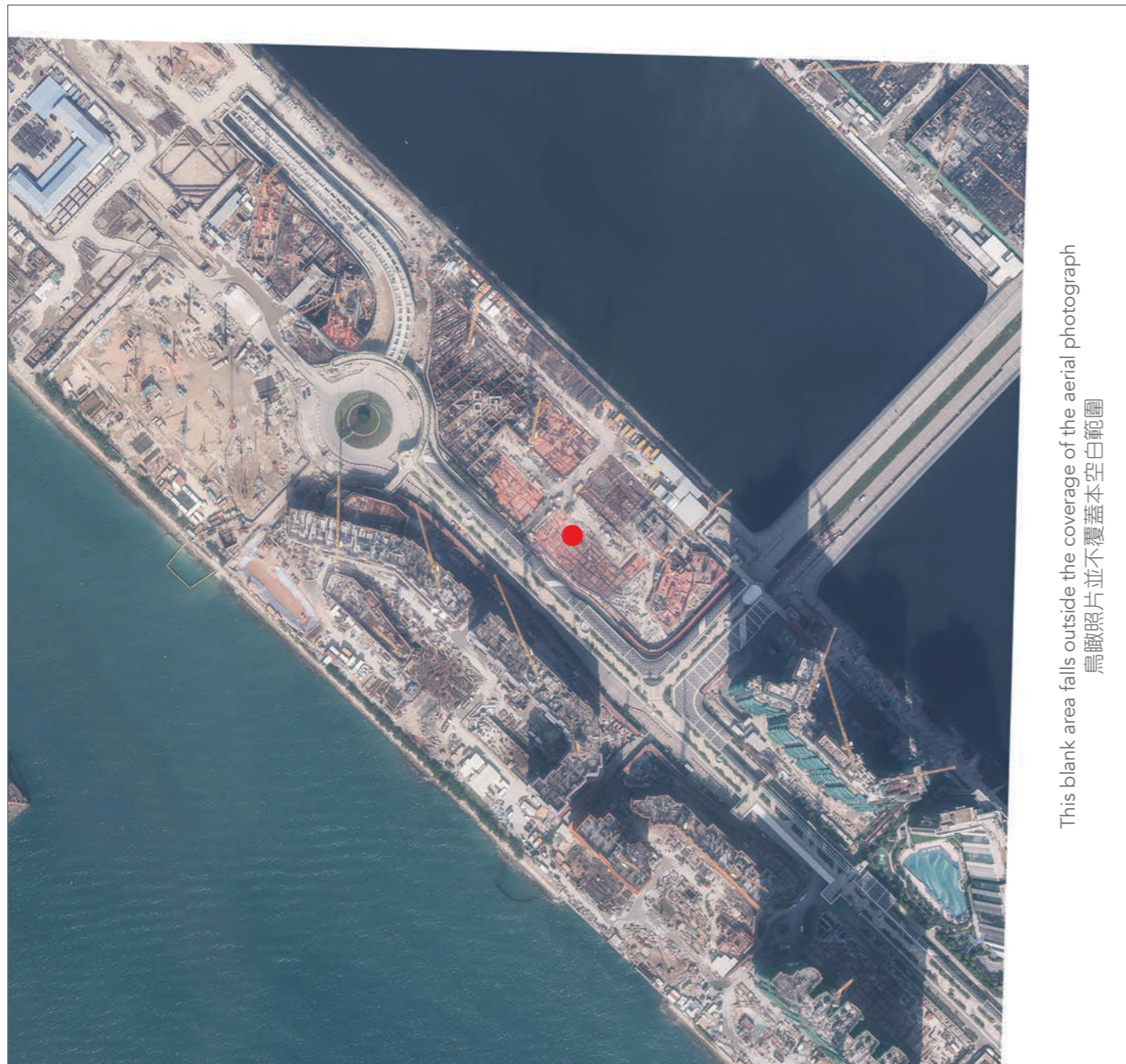
This blank area falls outside the coverage of the aerial photograph 鳥瞰照片並不覆蓋本空白範圍