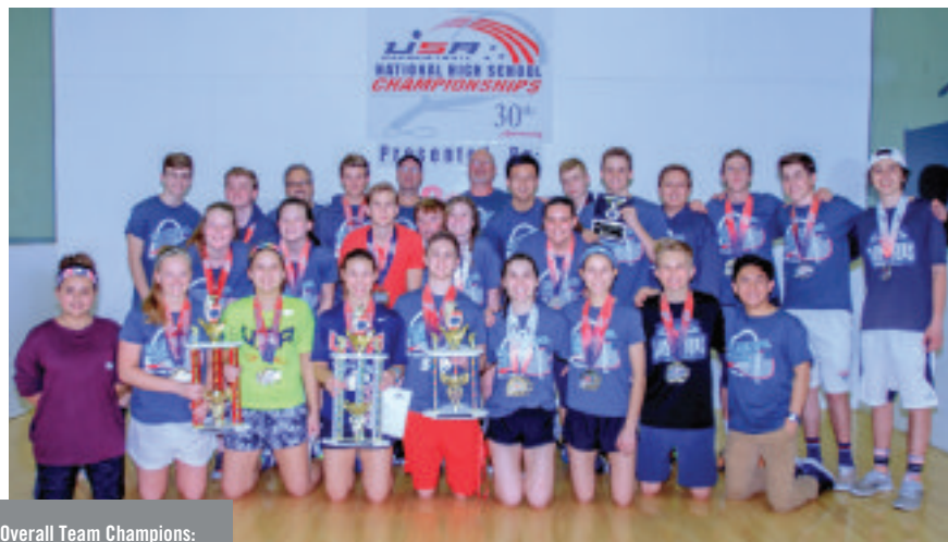
Overall Team Champions: Parkway West High School