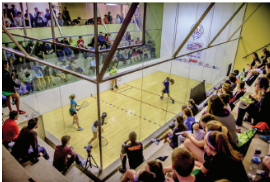
Girls #1 Doubles Finals - Beaverton HS vs. Parkway West HS