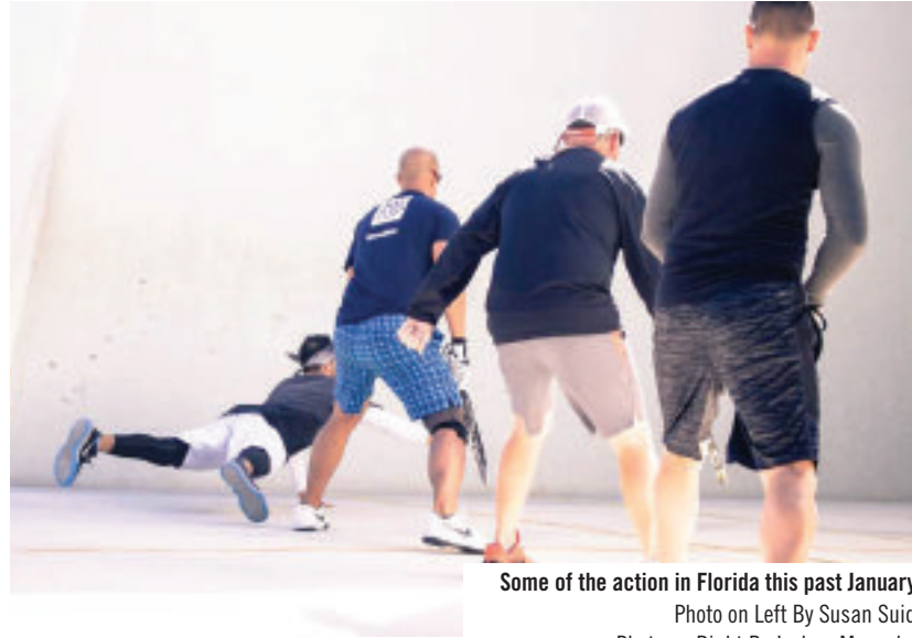
Some of the action in Florida this past January