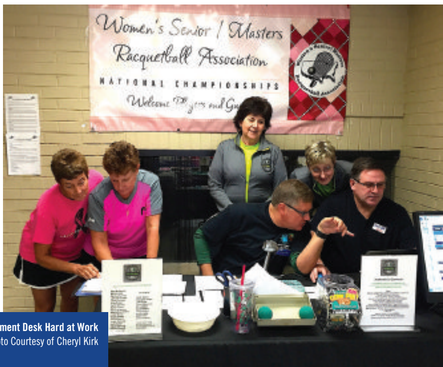
Tournament Desk Hard at Work

So 80 players ages 36-76 arrived from 21 states and Guatemala (which actually made this an INTERNATIONAL event). The round robin format ensures play on every day of the three-day tournament. The women competed in singles and doubles age divisions -- seven round robins and three pool-play-with-playoff formats. Forty-eight played in both singles and doubles (see "exercise" in Q1).