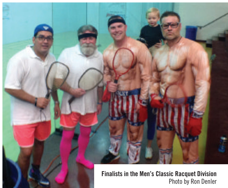
Finalists in the Men's Classic Racquet Division