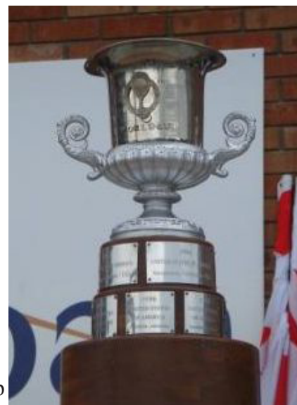
The World Cup