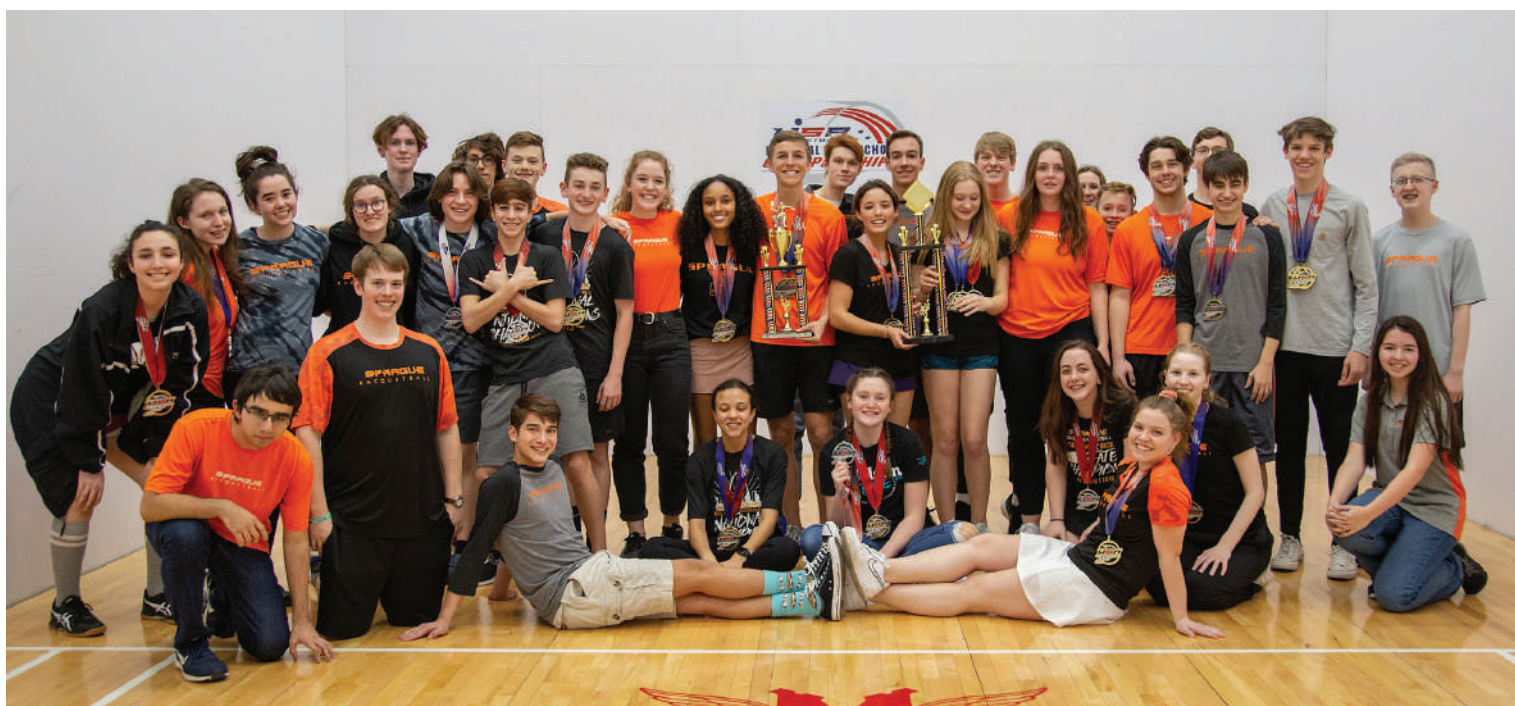
Left Top: Girls Team Champions - Barlow HS