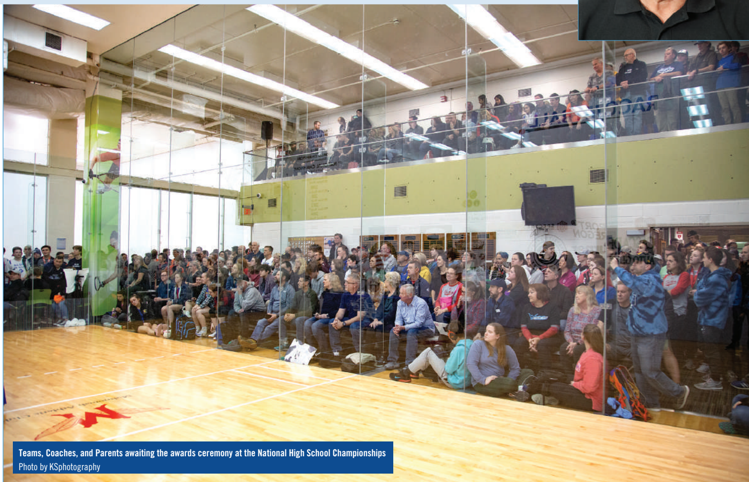
Teams, Coaches, and Parents awaiting the awards ceremony at the National High School Championships