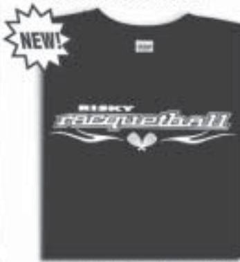
ITEM H -RISKY RACQ. BLACK M,L,XL $15 DESIGN IS FRONT