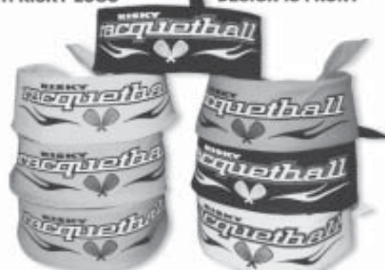
ITEM K -BANDANAS $6.00 OR 3 FOR $15.00 BLACK, WHITE, NAVY, YELLOW, GREY, GOLD, SKY BLUE, TURQUOISE AND BEIGE.

SHIP TO: NAME _____ ADDRESS _____ CITY _____ STATE _____ ZIP _____ TEL.# _____