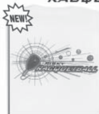
ITEM B -FUTURISTIC WHITE M,L,XL $15 FRONT: RISKY LOGO