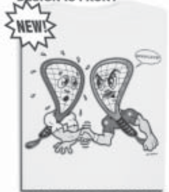
ITEM J -GOOD LUCK! WHITE M,L,XL $15 FRONT: RISKY LOGO