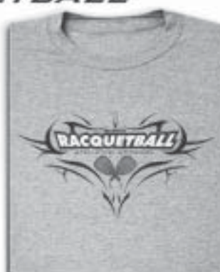
ITEM C -TRIBAL GREY M,L,XL $15 DESIGN IS FRONT