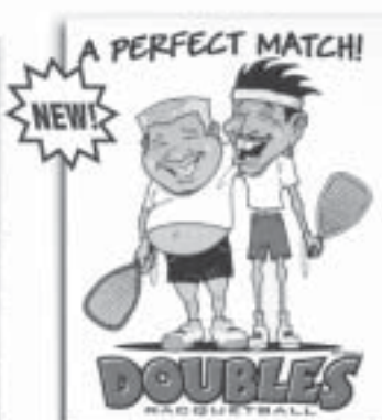
ITEM D -DOUBLES WHITE M,L,XL $15 FRONT: RISKY LOGO