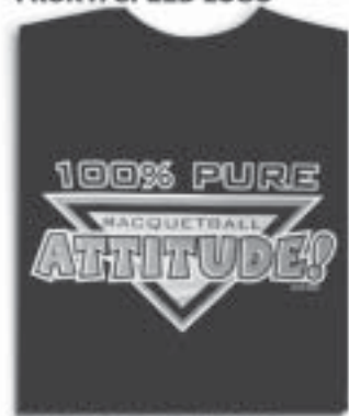
ITEM I -ATTITUDE BLACK M,L,XL $15 FRONT: ATTITUDE LOGO