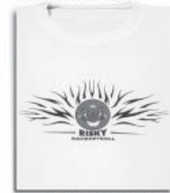
ITEM F -TRIBAL BALL WHITE M,L,XL $15 DESIGN IS FRONT