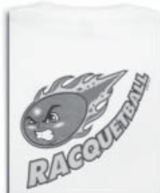
ITEM A -BALL WHITE M,L,XL $15 FRONT: RISKY LOGO

CHECK US OUT ON THE WEB! RISKYDESIGNS.COM