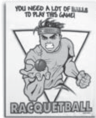
ITEM G -NEED BALLS WHITE M,L,XL $15 FRONT: RISKY LOGO