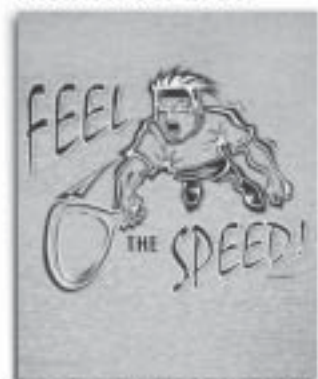
ITEM E -FEEL SPEED TAN OR GREY M,L,XL $15 FRONT: SPEED LOGO