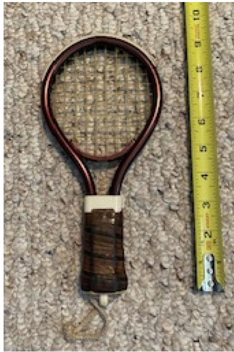
This racquet is 9 ¼"H x 4 ½"W