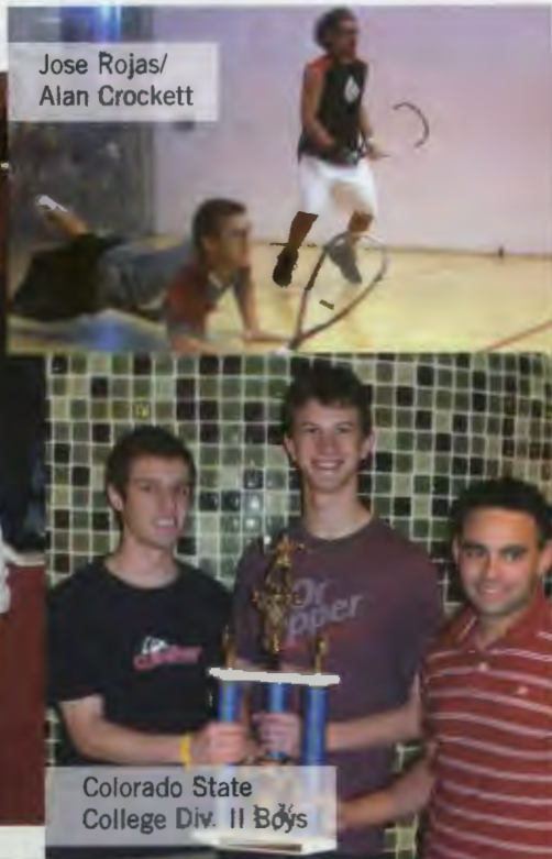
Colorado State College Div. II Boys

For the second time in collegiate racquetball history, Clarkson has captured the combined Division II title.