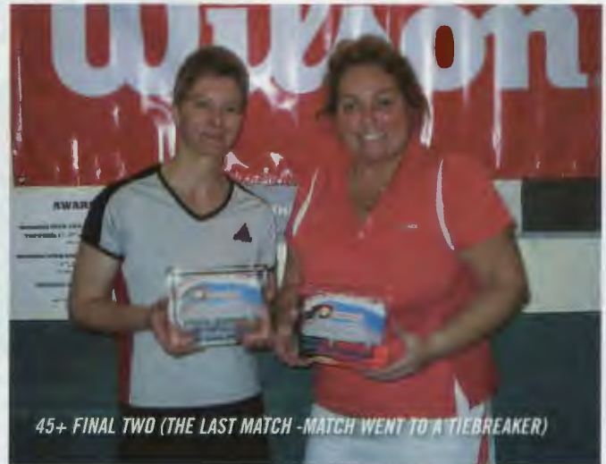
45+ FINAL TWO (THE LAST MATCH -MATCH WENT TO A TIEBREAKER)

Usually warm weather in the mid 80's greeted the 100 players arriving in Los Angeles for the 20th Annual Women's Senior/Masters Racquetball Championships, held January 16-18, 2009 at the Spectrum Club in Canoga Park. Many players gladly left behind frigid temperatures to flock to sunny California, and all the participants from New York to Hawaii were anticipating three days of exciting competition, camaraderie and fun! Not to mention, trips to the beach!