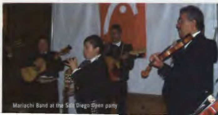
Mariachi Band at the San Diego Open party

The IRT returned to San Diego's American Athletic Club and was greeted with an amateur draw of over 300 players from Mexico and the United States. The IRT draw once again approached 50 here in San Diego, making it the largest of the season. This event offers much to the