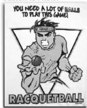
ITEM G -NEED BALLS WHITE M,L,XL $15 FRONT: RISKY LOGO