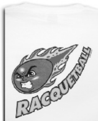
ITEM A -BALL WHITE M,L,XL $15 FRONT: RISKY LOGO

CHECK US OUT ON THE WEB! RISKYDESIGNS.COM