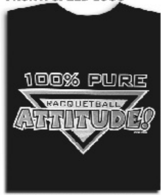
ITEM I -ATTITUDE BLACK M,L,XL $15 FRONT: ATTITUDE LOGO