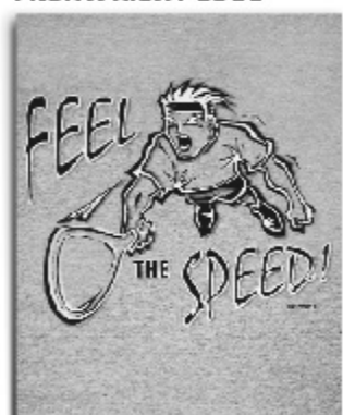
ITEM E -FEEL SPEED TAN OR GREY M,L,XL $15 FRONT: SPEED LOGO