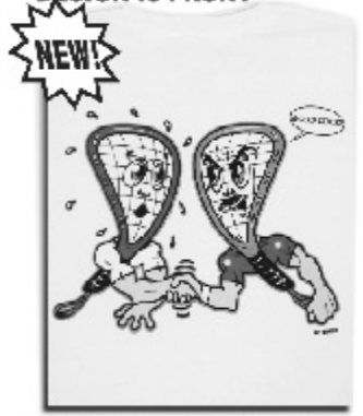
ITEM J -GOOD LUCK! WHITE M,L,XL $15 FRONT: RISKY LOGO