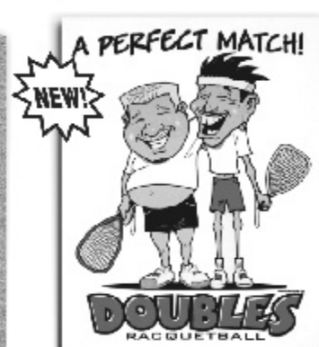
ITEM D -DOUBLES WHITE M,L,XL $15 FRONT: RISKY LOGO