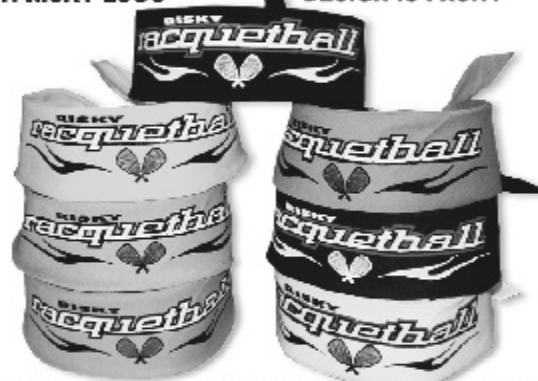
ITEM K -BANDANAS $6.00 OR 3 FOR $15.00 BLACK, WHITE, NAVY, YELLOW, GREY, GOLD, SKY BLUE, TURQUOISE AND BEIGE.

SHIP TO: NAME _____ ADDRESS _____ CITY _____ STATE _____ ZIP _____ TEL.# _____