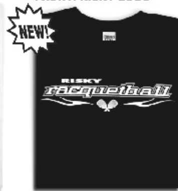
ITEM H -RISKY RACQ. BLACK M,L,XL $15 DESIGN IS FRONT