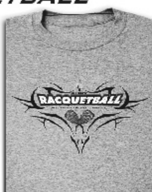
ITEM C -TRIBAL GREY M,L,XL $15 DESIGN IS FRONT