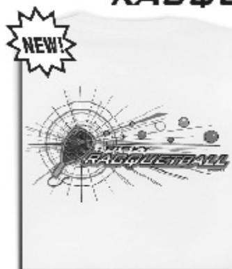
ITEM B -FUTURISTIC WHITE M,L,XL $15 FRONT: RISKY LOGO