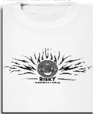
ITEM F -TRIBAL BALL WHITE M,L,XL $15 DESIGN IS FRONT