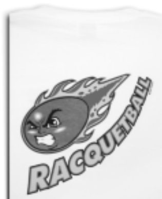
ITEM A -BALL WHITE M,L,XL $15 FRONT: RISKY LOGO

CHECK US OUT ON THE WEB! RISKYDESIGNS.COM