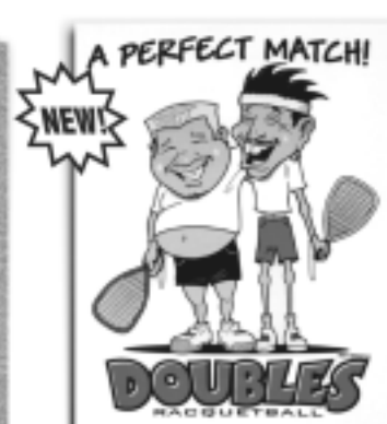
ITEM D -DOUBLES WHITE M,L,XL $15 FRONT: RISKY LOGO