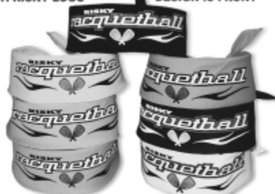
ITEM K -BANDANAS $6.00 OR 3 FOR $15.00 BLACK, WHITE, NAVY, YELLOW, GREY, GOLD, SKY BLUE, TURQUOISE AND BEIGE.

SHIP TO: NAME _____ ADDRESS _____ CITY _____ STATE _____ ZIP _____ TEL.# _____