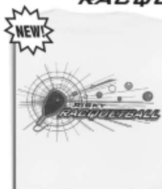
ITEM B -FUTURISTIC WHITE M,L,XL $15 FRONT: RISKY LOGO