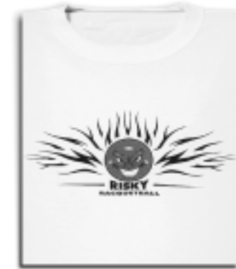
ITEM F -TRIBAL BALL WHITE M,L,XL $15 DESIGN IS FRONT