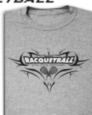
ITEM C -TRIBAL GREY M,L,XL $15 DESIGN IS FRONT