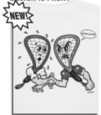
ITEM J -GOOD LUCK! WHITE M,L,XL $15 FRONT: RISKY LOGO