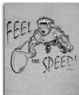
ITEM E -FEEL SPEED TAN OR GREY M,L,XL $15 FRONT: SPEED LOGO