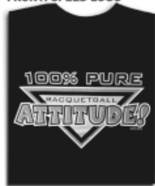
ITEM I -ATTITUDE BLACK M,L,XL $15 FRONT: ATTITUDE LOGO