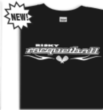
ITEM H -RISKY RACQ. BLACK M,L,XL $15 DESIGN IS FRONT