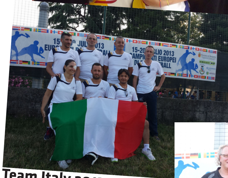
Team Italy 2013