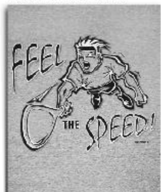
ITEM E -FEEL SPEED TAN OR GREY M,L,XL $15 FRONT: SPEED LOGO