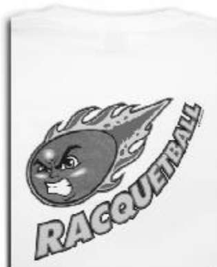
ITEM A -BALL WHITE M,L,XL $15 FRONT: RISKY LOGO

CHECK US OUT ON THE WEB! RISKYDESIGNS.COM