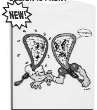
ITEM J -GOOD LUCK! WHITE M,L,XL $15 FRONT: RISKY LOGO