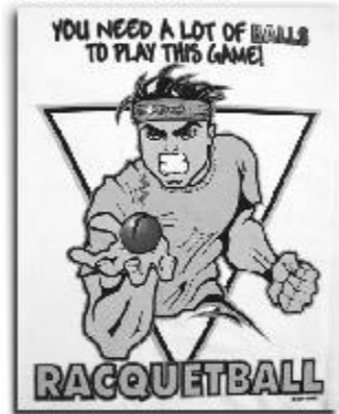
ITEM G -NEED BALLS WHITE M,L,XL $15 FRONT: RISKY LOGO