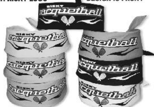
ITEM K -BANDANAS $6.00 OR 3 FOR $15.00 BLACK, WHITE, NAVY, YELLOW, GREY, GOLD, SKY BLUE, TURQUOISE AND BEIGE.

SHIP TO: NAME _____ ADDRESS _____ CITY _____ STATE _____ ZIP _____ TEL.# _____