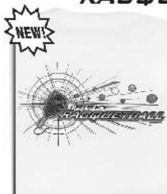
ITEM B -FUTURISTIC WHITE M,L,XL $15 FRONT: RISKY LOGO