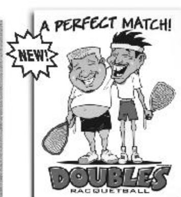
ITEM D -DOUBLES WHITE M,L,XL $15 FRONT: RISKY LOGO