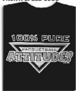
ITEM I -ATTITUDE BLACK M,L,XL $15 FRONT: ATTITUDE LOGO