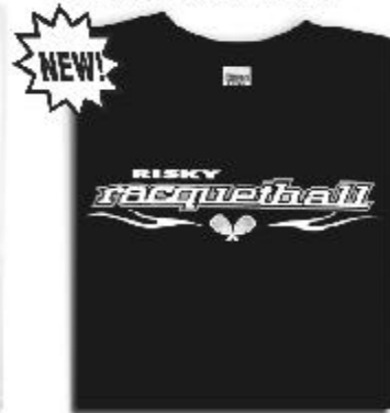
ITEM H -RISKY RACQ. BLACK M,L,XL $15 DESIGN IS FRONT