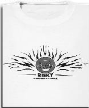
ITEM F -TRIBAL BALL WHITE M,L,XL $15 DESIGN IS FRONT