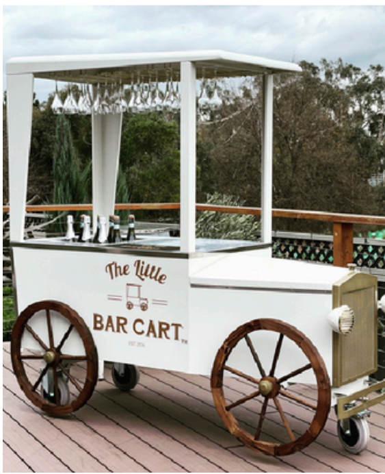
LITTLE BAR CART Prices from $500

Creating beautiful vegan meals & sweets to nourish your body + soul and delight your senses. Heart baked cake measuring 7" x 1.5" All baked cakes are a filled double layer. Extra layers can be added for extra height or different sizes can be stacked for your desired look.