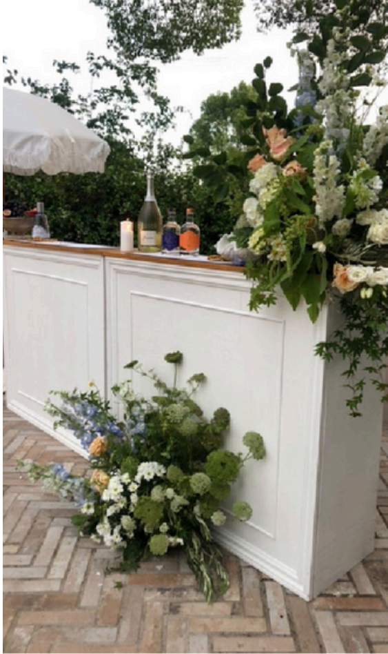
TIPSY MARE BAR SERVICE Prices from $1000

Operating as a DIY Mobile Bar Service providing you with an amazing experience. Friendly & Talented Staff will ensure your event will Run smoothly and always keeping your guests happy and hydrated. Whether it's a full bar service you need or just RSA staff, Tipsy are happy to help!