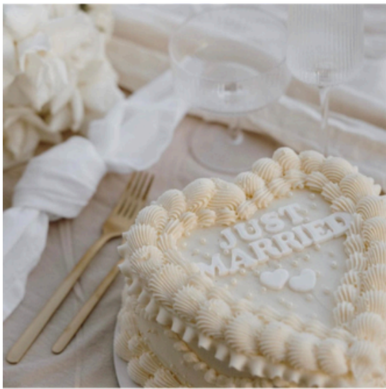
MAPLE & SAGE Prices from $80

Operating as a DIY Mobile Bar Service providing you with an amazing experience. Friendly & Talented Staff will ensure your event will Run smoothly and always keeping your guests happy and hydrated. Whether it's a full bar service you need or just RSA staff, Tipsy are happy to help!