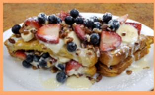
Gourmet Fruit & Nut Stuffed French Toast