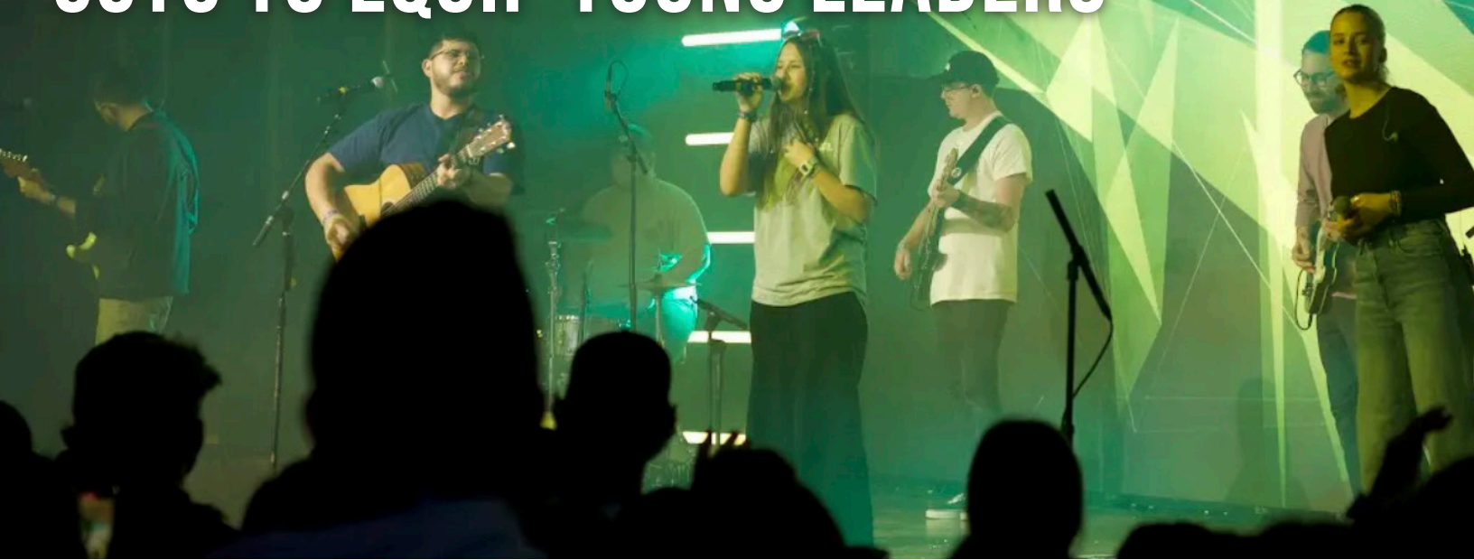
Young Leaders leading worship at youth convention

Young Leaders is a church leadership development program, created by the Carolina Christian Youth Conference (CCYC) to identify and mentor at least 200 Christian high school students (grades 10–12) by 2030. They launched their inaugural class in January with 19 students at a kickoff retreat.