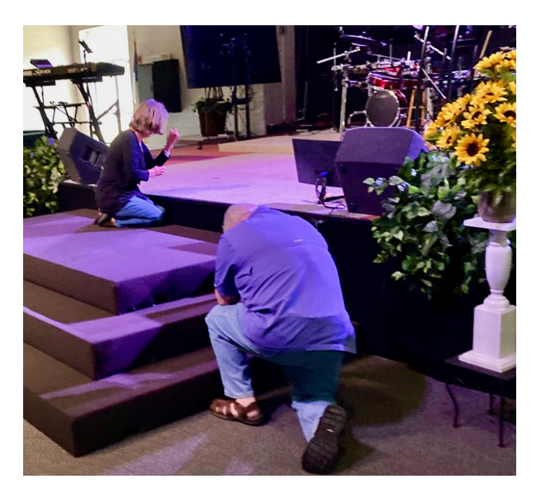
Summit participants praying over the stage and seating areas

Typically Summits are held on a Saturday morning and churches are encouraged to invite their staff, Elders, Deacons, Prayer Team, Greeter Team, Worship Team, and other interested people and spouses.