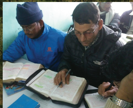
Disciple-makers in training