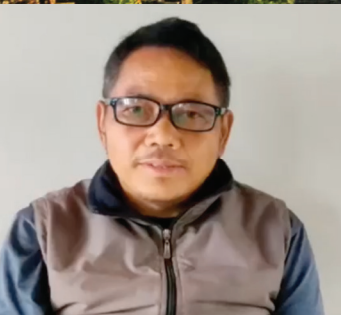
Nepalese church planters

When Waypoint hosted the International Conference on Missions (ICOM) in Richmond last November, churches from around the region contributed over $400,000 toward a special campaign to see 21 new churches planted around the globe through five trusted international church planting organizations.