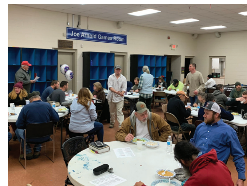
The Table’s Sunday evening gathering

While about 75 people attend their weekly Sunday gathering, The Table’s weekly influence reaches hundreds through a growing number of disciple-led Discovery Bible Studies around town.