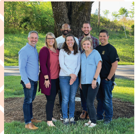
New Hope staff