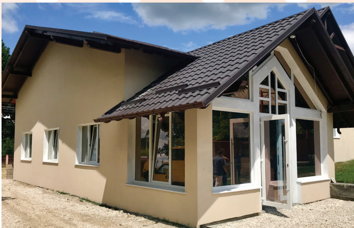
Converted church building in Ialoveni, Moldova

Thank you Waypoint partners for making a Kingdom impact around our region AND BEYOND!