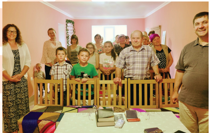
New church in Vinatori, Moldova