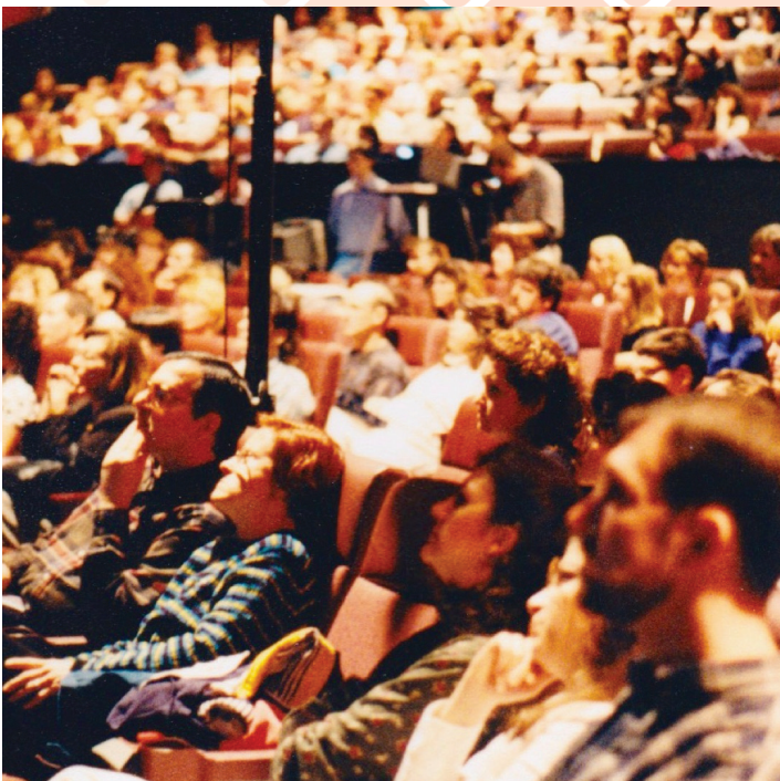
Forefront Church opening day in 1998