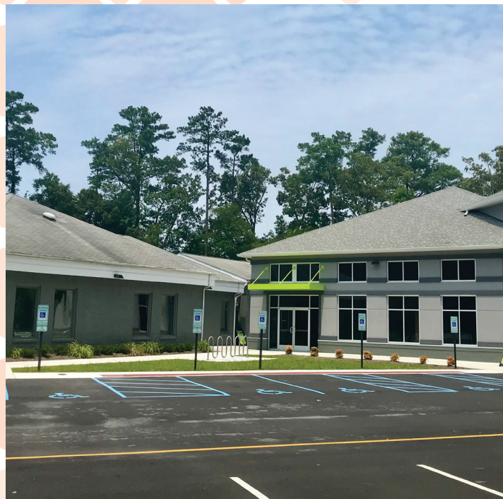
Forefront Church today