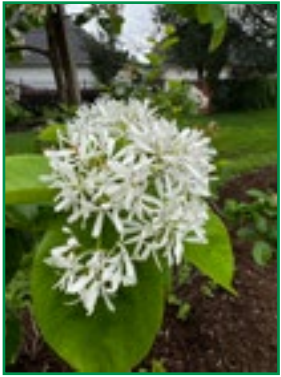
Chinese Fringe Tree