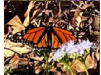
And a beautiful visitor