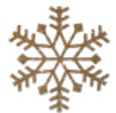
The Commonwealth Holiday Party. And a great time was had by all.....