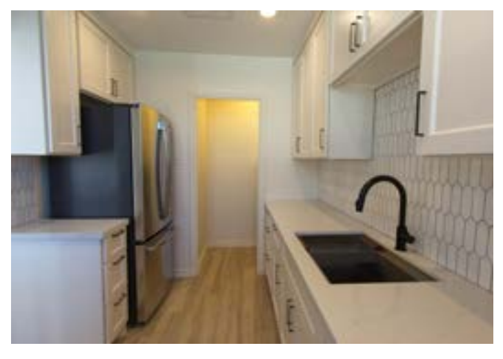
More furniture, blinds, etc. to follow. We will provide more photos next edition.

Once again, a huge thank you to these ladies for their efforts on behalf of the community: