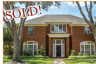
4310 Browning Ct.