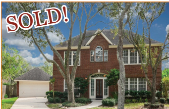
38 Bradford Circle