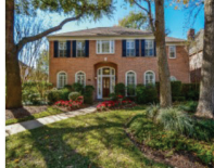
4722 Yorkshire $479,800