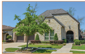
6906 Taylor Medford $495,000