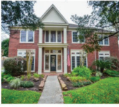
4310 Saint Michaels $889,000