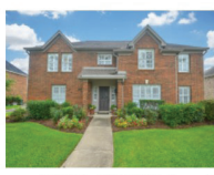
3811 St Michaels $449,000