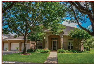
3402 Onion Creek $899,000