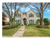
4819 Burbury $544,800