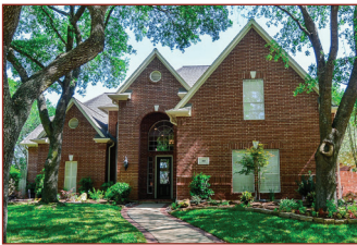
30 Martins Way $764,000