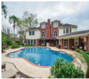
63 Sterling $649,800