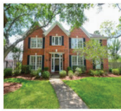
31 Burwick $615,000