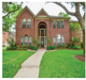
4903 Keneshaw $524,000