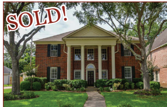
4531 Warwick Dr.