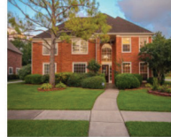
10 Seaton Ct $449,000