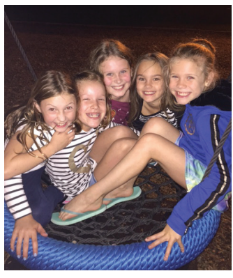
Some of our younger residents enjoying Camp Commonwealth!

To get updates and reminders about Commonwealth issues and events, make sure you are on our Email Alert List! Stay in the loop!