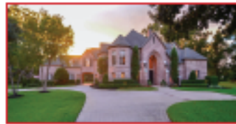
3555 Marmatha $2,650,000