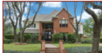
20 Sherwood Isle $649,900