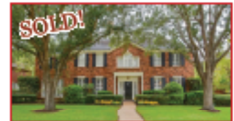
3718 Stacksbridge Dr.

We LOVE in this community, BEHAVE in the community and SUPPORT in the community!