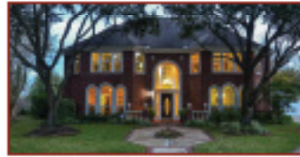
4610 Warwick Ct. $799,999