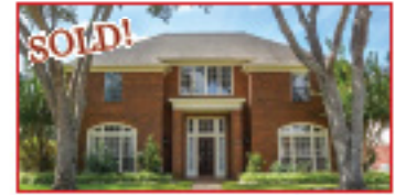
4310 Browning Ct.