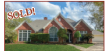
5434 Arvestale Dr.