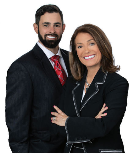
We LIVE in this community, BELIEVE in the community and SUPPORT in the community!