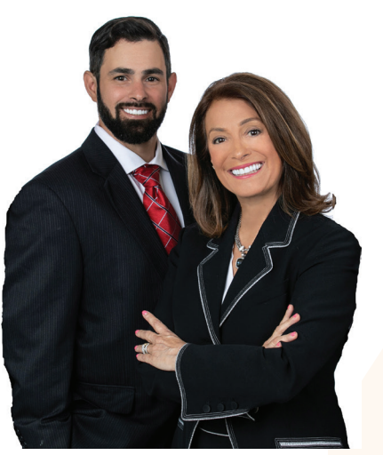
We LIVE in this community, BELIEVE in the community and SUPPORT in the community!