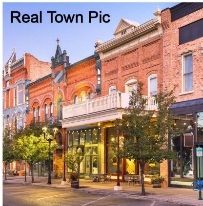
Real Town Pic