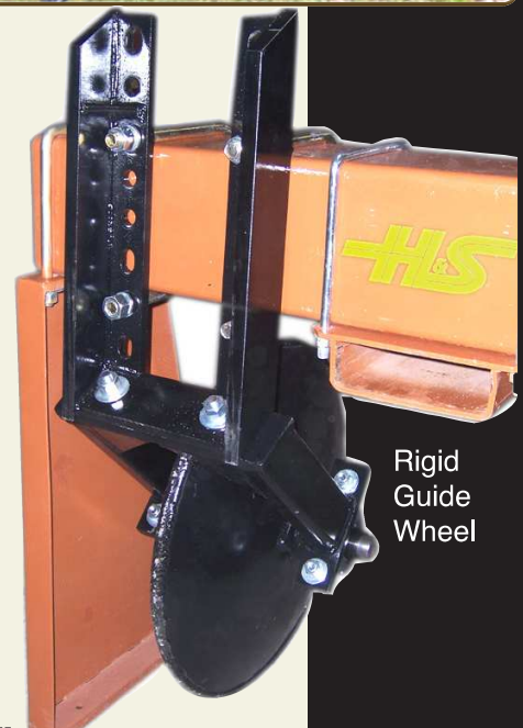
Rigid Guide Wheel