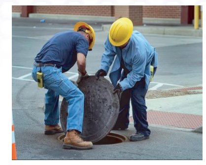
Less than half iron weight Safer for back, fingers, toes. But the heftiest composite