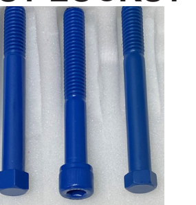
Encapsulated detectable technology...not attached metal. Unique to CAP.