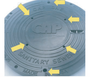
CAPs hold in odor, but we also have vented options. Locks are Xylan coated, 316 SS with bolt head options.