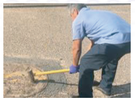
Sledgehammers - Unnecessary Reduce Damage & Injuries