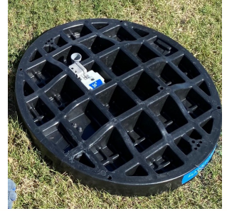
Signals pass through. No wire holes needed. No top surface antenna. Skip drilling. "Protect your tech."