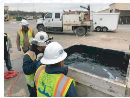
Validated. "Best By Far" Watertight - 0.0 GPM Submerged in 16"!