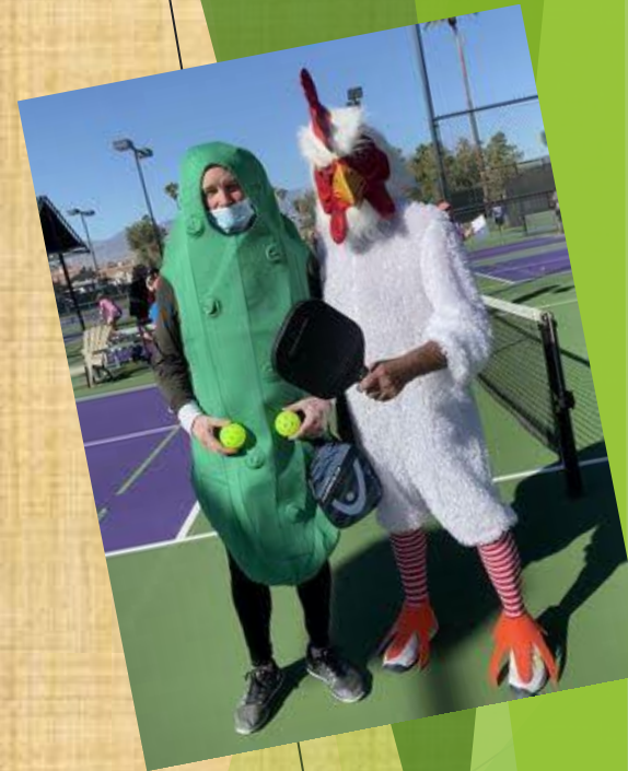
The author as a pickle with balls is pictured above