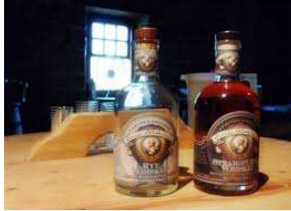
The distillery is fully operational and a great tour. They will happily sell you product. Also, when you take the Mansion tour, you will enter into the "New Room", which was Washington's pride. On display are six landscapes. If you are from the upstate New York, ask to be shown Winstanley's Genesee Falls