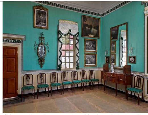
(shown above), painted in the late 18th C. when Rochester was still wilderness.