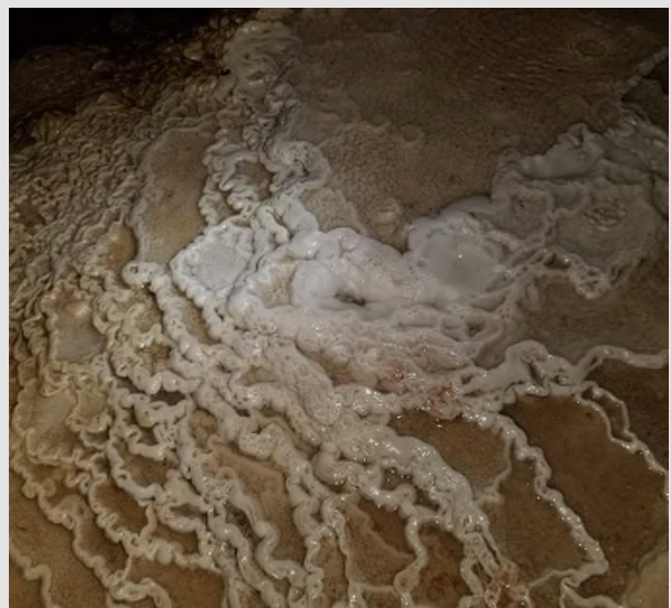
Rimstone in Jacob's Cave