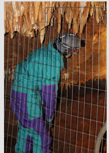
Christen Easter behind the fence