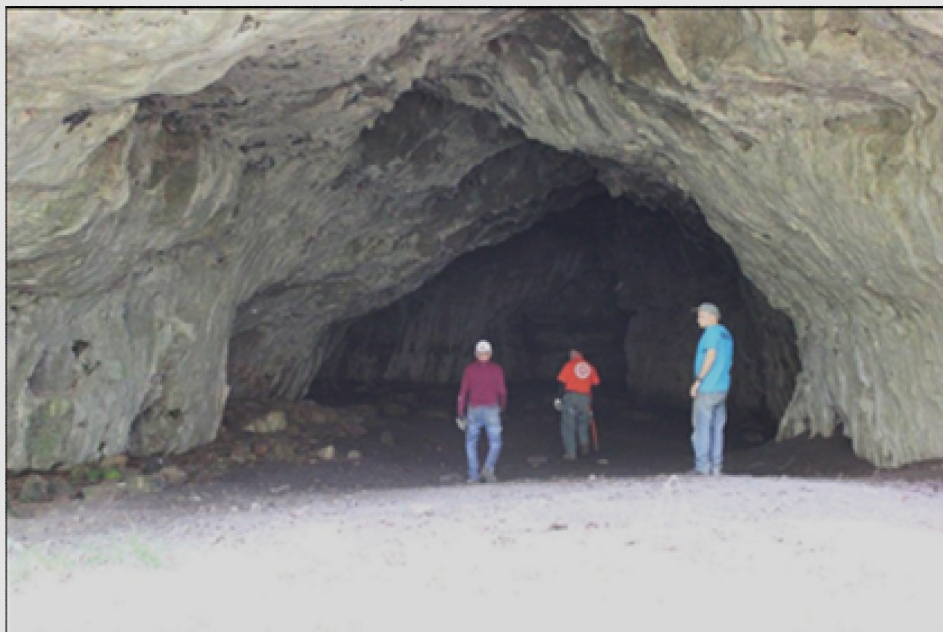
Toby Cave Entrance