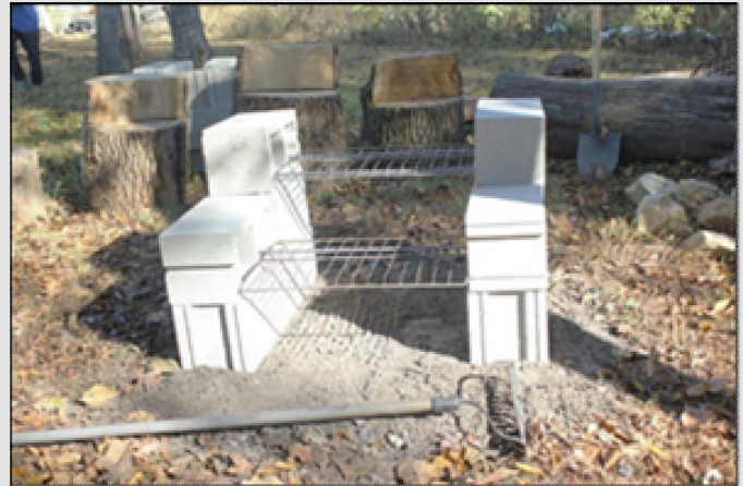
New fire pit-grill

Klaus and Gary returned and the tin was unloaded. They started to work on four post holes for a shed to store firewood, the lawnmower and other items. Elizabeth took one of the post hole diggers and attempted to dig on one of the holes. After all four holes were dug, cement was tamped in each hole. We couldn't do any more since we didn't have everything we needed to finish the project.