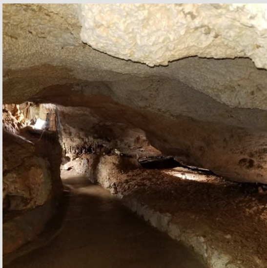
Tour passage in Jacob's Cave