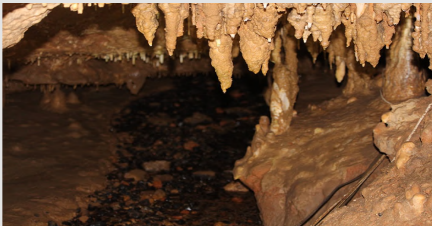
Nice little small stream passage