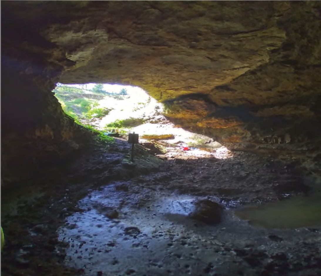
Looking out of Goodwin Sinkhole, Laclede County

The Speleograph, a bi-yearly publication, is created by the Lake Ozarks Grotto. All articles and other information is donated by cavers and individuals who have an interest in caving.