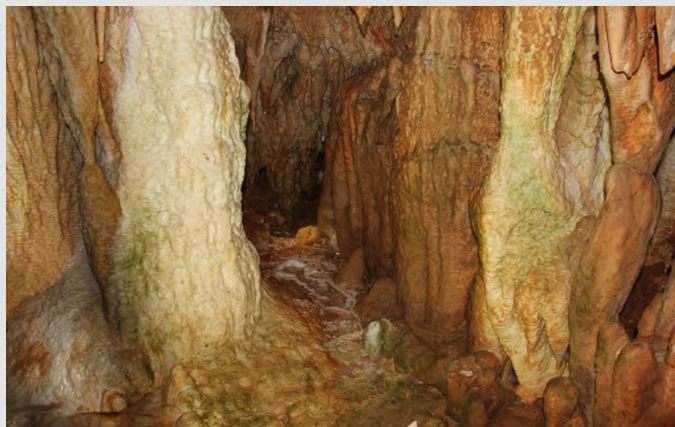
Small rim stone dam in Jacob's Cave