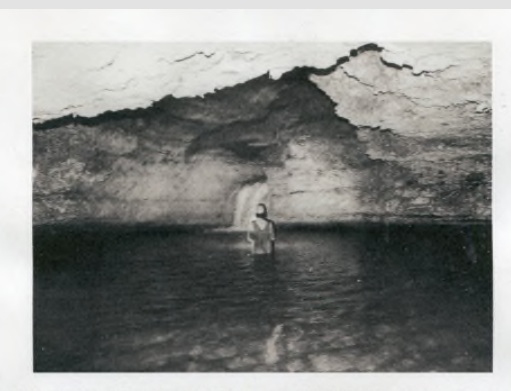
AT THE TIME OF HAWKSLEY'S DESCENT the water in the lake below was shallow except at the plunge pool.

HAWKSLEY ON THE LAKE BELOW. AN IN-FLATABLE BOAT TIED TO A ROPE WAS TOSSED DOWN AHEAD OF HIM.