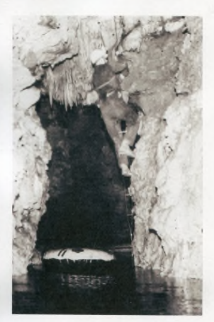
UPPER LEFT—Looking down at Mystery Lake. TOP—Dwight Weaver descends to an inflatable raft on Mystery Lake. LEFT—Gary Zumwalt and Scott Jenkins on Spirit Lake before their historic dive of the siphon.