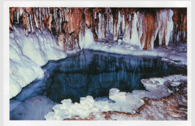
AZURE POOL in the LEFT FORK of CARROLL CAVE.