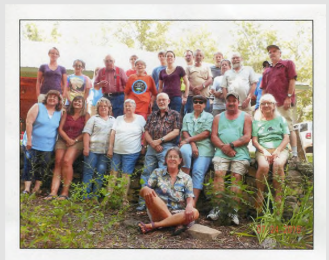
LAKE OZARKS GROTTO MEMBERS, SPOUSES and SEVERAL OFF SPRING 2016 THANK YOU FOR ATTENDING OUR 50 ANNIVERSARY