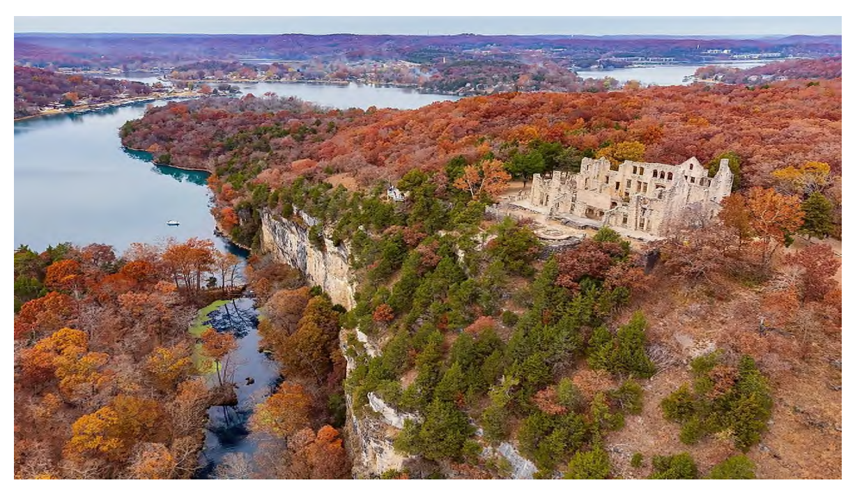
Aerial view of Ha Ha Tonka park

There are many places in the Missouri Ozarks noted for beauty, intrigue, romance and history but to have it all in one place is pure magic! At Ha Ha Tonka State Park the natural wonders and curiosities are blended with cultural artifacts in a most unique way. People who discover this gem of springs, sinkholes, natural bridges, caves, cliffs, woodlands, glades, savannas, hills, hollows, lakes, trails, boardwalks, outlaw history and the ruins of a spectacular castle and carriage house usually return again and again.