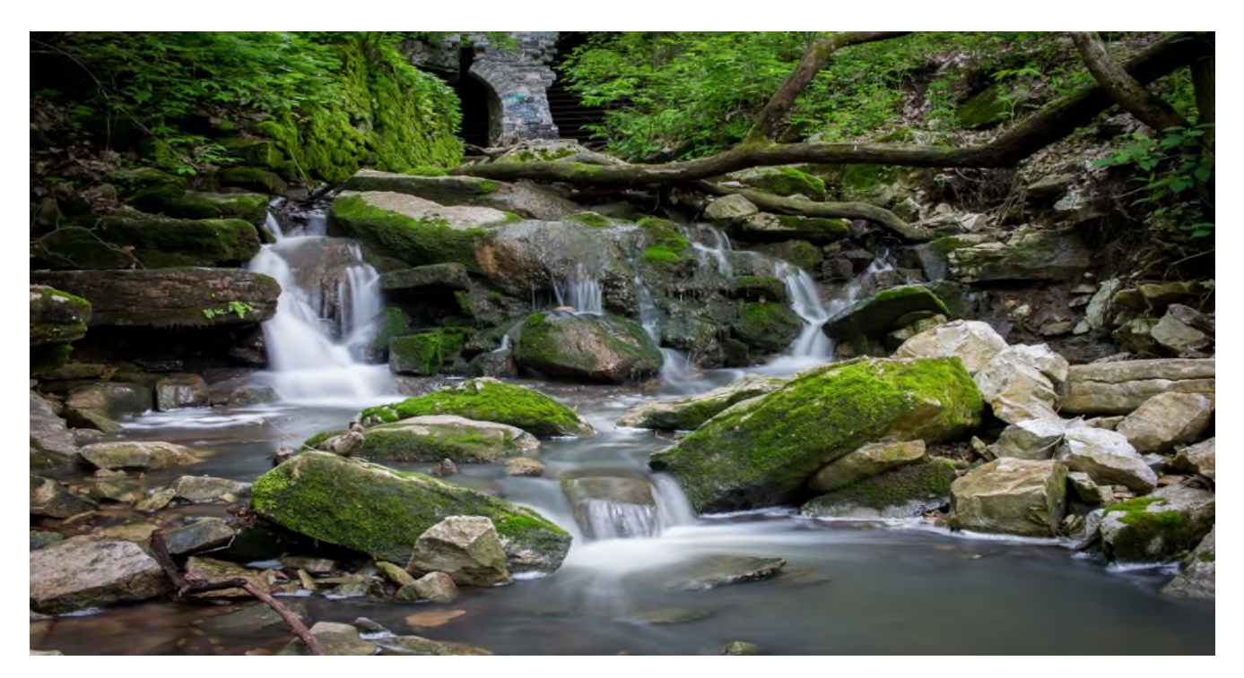
Water flowing from the Cliff cave system

"It's hard for us as individuals to deal with plastic pollution because of the pervasiveness of these materials, but it helps to be mindful of your personal plastic use," Hasenmueller said. "Individuals can avoid buying plastic materials like synthetic textiles used in clothing, but doing so presents challenges to everyday consumers. On a larger scale, we, as a society, could move away from synthetic clothing, because a lot of the debris that we found in this cave was synthetic fibers from textiles. And of course, reducing our overall plastic production and consumption would help as well."