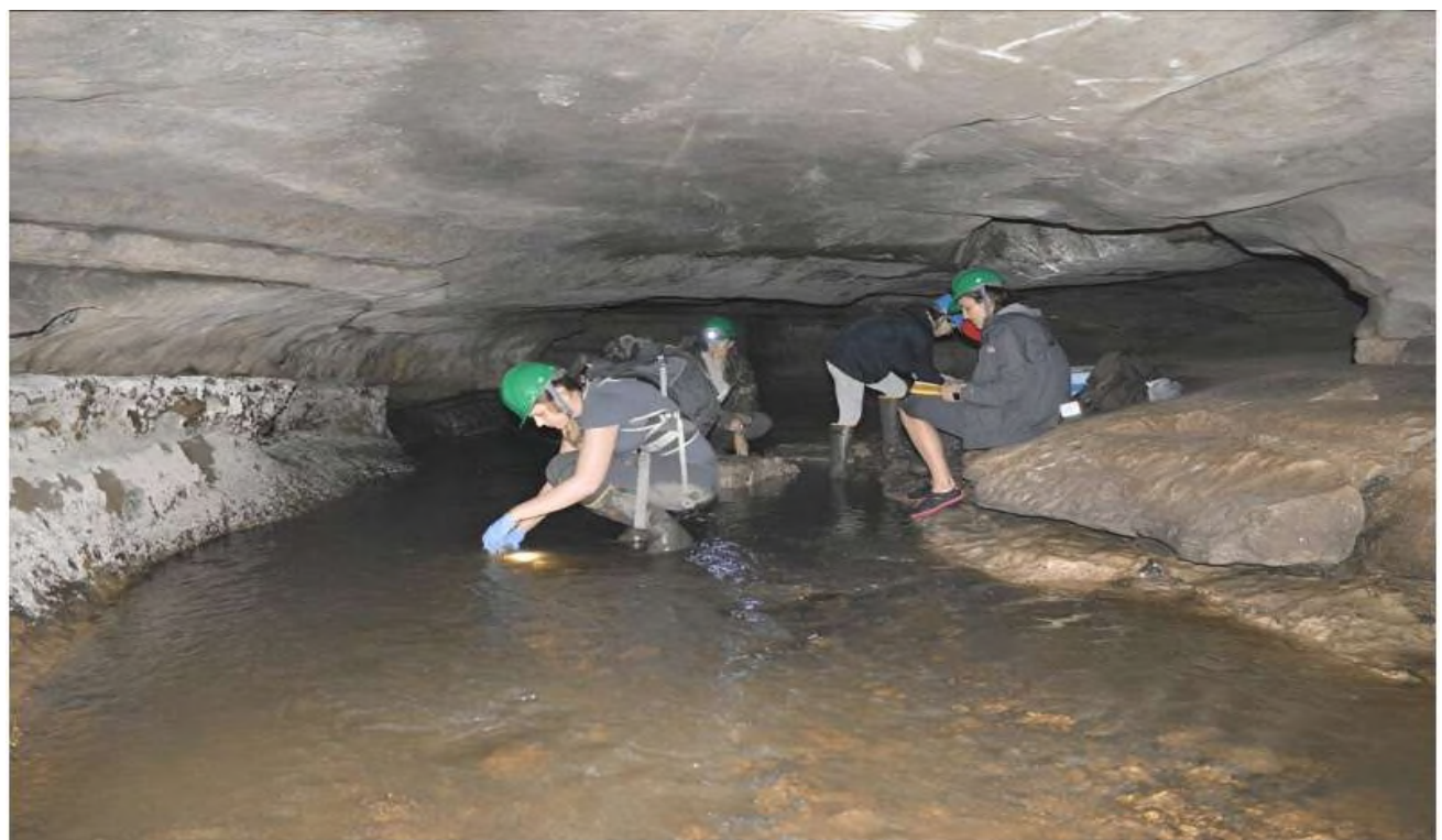
Saint Louis University students sample the Cliff Cave system near St. Louis, Mo