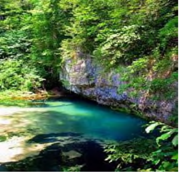
Ha Ha Tonka Spring

And if its June or July, just a short jaunt away is one of the park's most beautiful glades with abundant wildflowers.