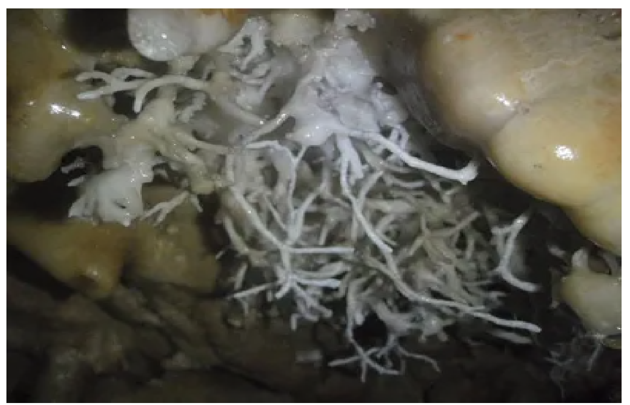
The astonishing beauty in a Missouri cave

The Speleograph, a bi-yearly publication, is created by the Lake Ozarks Grotto. All articles and other information is donated by cavers and individuals who have an interest in caving. For more information please visit us on the web: