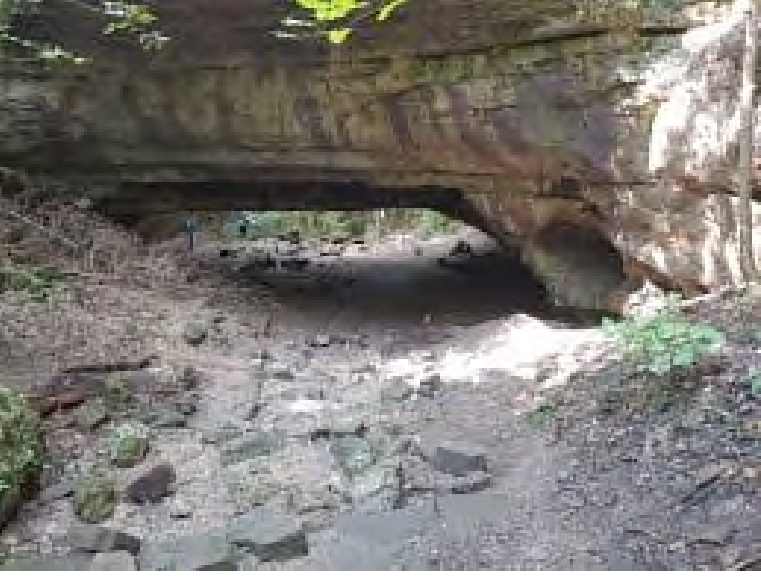
Ha Ha Tonka natural bridge

ground water every day. Only a small percentage of visitors take on the challenge of exploring the trails that radiate elsewhere throughout the several thousand acres of the park. Marvelous things are tucked away in those backwoods areas along the outbound trails of Ha Ha Tonka. The park has 15 miles of trails but you don't have to hike to the bitter end of every trail to find something interesting.