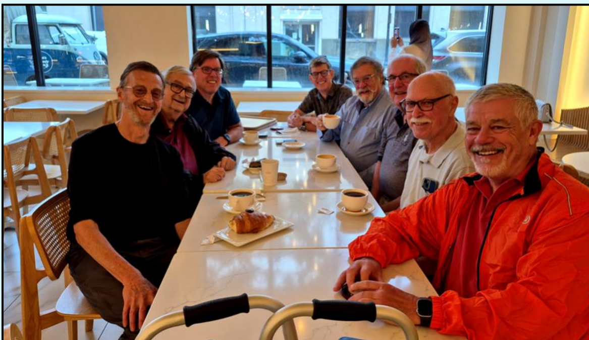
Members of the Men's Connection took a field trip to Jabal Coffee House in Dearborn.

In this program, New York Polyphony approaches the theme of “Eternity” in several ways. Through plainsong, early polyphony, and more complex Renaissance works, they show the eternal nature of music as a vehicle for beauty and text “painting” through the musical development in Western Music. The manuscript sources provide an undercurrent for this program, encouraging a sense of connection between the ancient and modern in the transformation of music from the page to the interpretation of the singers.